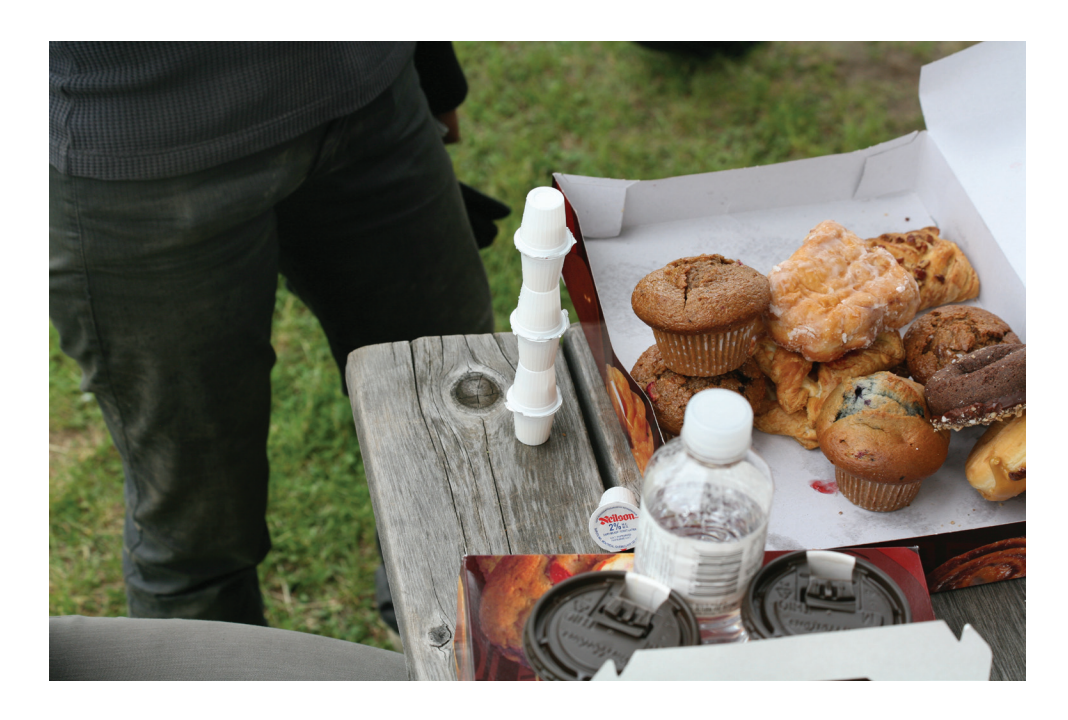
10, 11. Stills from documentation of The Seduction of Galilei , June 11, 2011. Event; Stouffville, Ontario; commissioned by Mercer Union, Toronto. Collection of the artist; courtesy Mary Boone Gallery, New York, and Galería Joan Prats, Barcelona