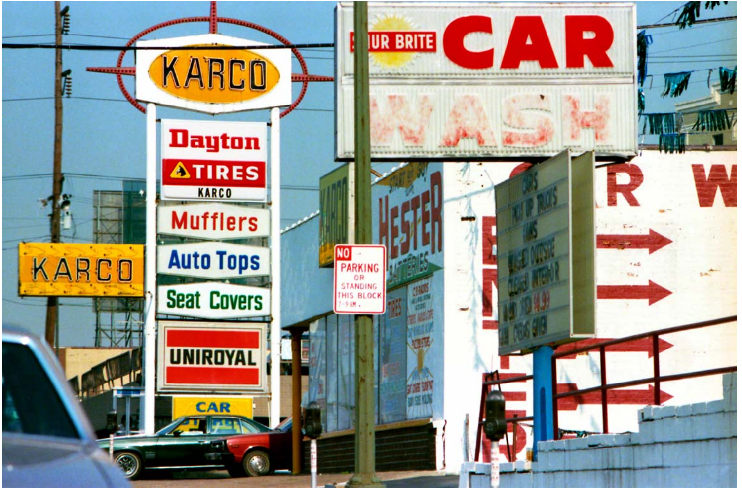
Figure 6 Karco, c. 1983-86, from The Democratic Forest, 1989 c. 1983-86 Exhibition print , 16 x 20 (40.6 x 50.8) Cheim & Read, New York