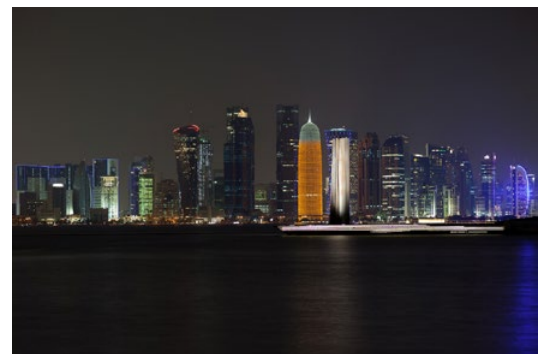
The Doha skyline captured from the Museum of Islamic Art, September 30, 2012. © Jimmy Balkovicius via Flickr. This file is licensed under the Creative Commons Attribution-ShareAlike 2.0 Generic license

An American invention, the shopping mall is a ubiquitous form of architecture that rarely reflects the geographic or cultural specificity of its location. “I can’t tell if I’m in Hong Kong or L.A. or Dubai half the time I walk into a mall,” Al-Maria has said. “And that happens more and more these days because the mall is the dominant structure of a certain class group of which I am part. I literally find myself in malls whether on holiday or on my way home from work or on a weekend even and I am frequently confused