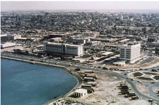
Skyline view of Doha, Qatar, February 1, 1977.