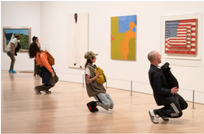
Maia Chao, BEING MOVED , 2026. Performance, Whitney Museum of American Art, New York, May 14–17, 2026. Commissioned by the Whitney Museum of American Art.

These images are approved only for publication in conjunction with the promotion of Whitney Biennial 2026 . Each image may not be cropped, bled off the page, colorized, solarized, overlaid with other matter (e.g., tone, text, another image, etc.), or otherwise altered, except as to overall size. Reproductions must include the full caption information adjacent to the image. Download high-resolution image files on the Whitney press site.