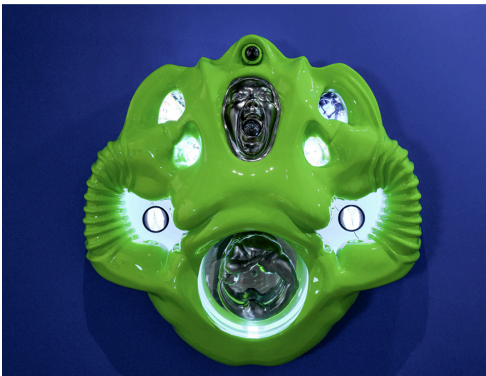
Installation view of Whitney Biennial 2026 (Whitney Museum of American Art, March 8–August 2026).