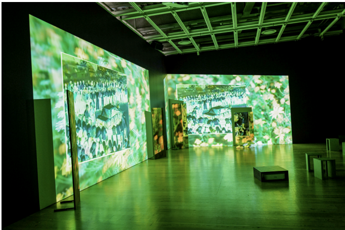
Installation view of Whitney Biennial 2026 (Whitney Museum of American Art, March 8–August 2026).