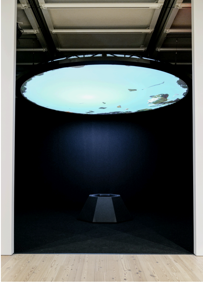
Installation view of Whitney Biennial 2026 (Whitney Museum of American Art, March 8–August 2026).