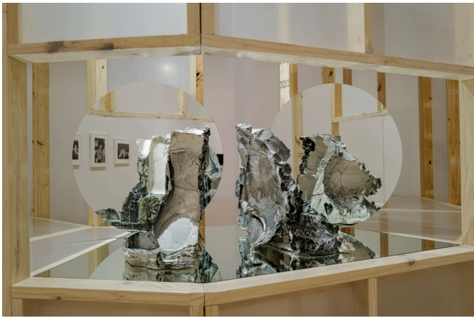
Installation view of Whitney Biennial 2026 (Whitney Museum of American Art, March 8–August 2026).