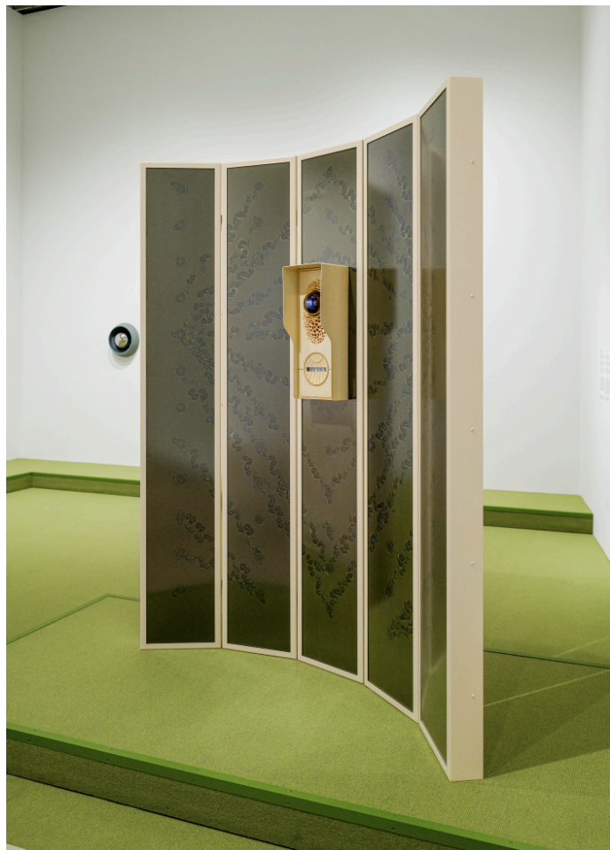
Installation view of Whitney Biennial 2026 (Whitney Museum of American Art, March 8–August 2026).