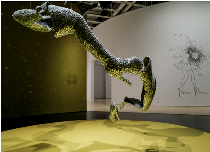
Installation view of Whitney Biennial 2026 (Whitney Museum of American Art, March 8–August 2026).