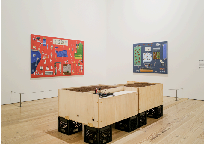
Installation view of Whitney Biennial 2026 (Whitney Museum of American Art, March 8–August 2026).