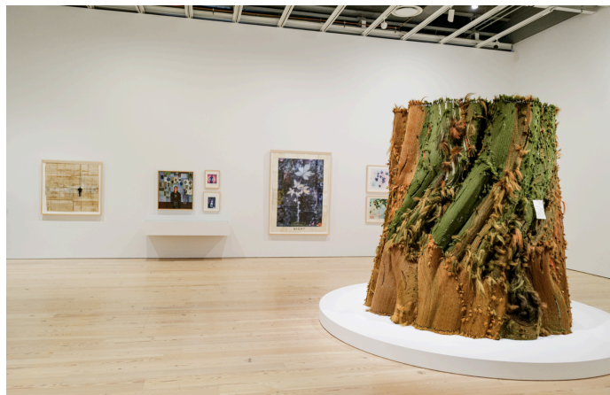
Installation view of Whitney Biennial 2026 (Whitney Museum of American Art, March 8–August 2026).