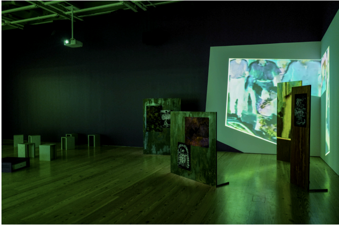
Installation view of Whitney Biennial 2026 (Whitney Museum of American Art, March 8–August 2026).