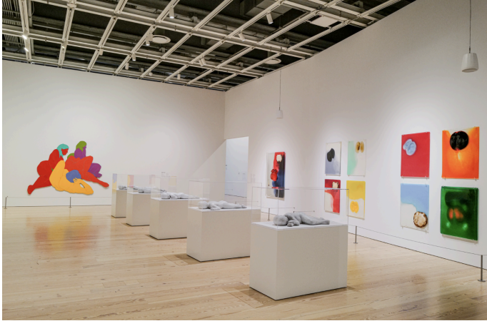
Installation view of Whitney Biennial 2026 (Whitney Museum of American Art, March 8–August 2026).