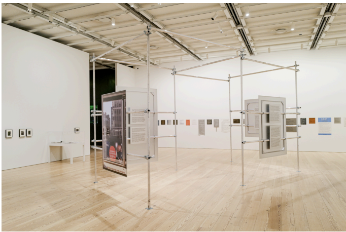
Installation view of Whitney Biennial 2026 (Whitney Museum of American Art, March 8–August 2026).