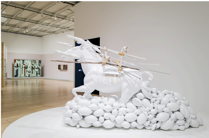
Installation view of Whitney Biennial 2026 (Whitney Museum of American Art, March 8–August 2026).