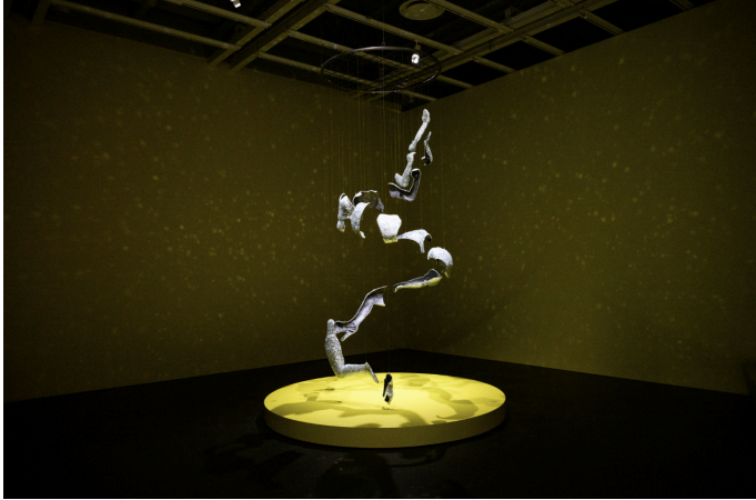
Installation view of Whitney Biennial 2026 (Whitney Museum of American Art, March 8–August 2026).