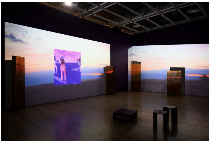
Installation view of Whitney Biennial 2026 (Whitney Museum of American Art, March 8–August 2026).