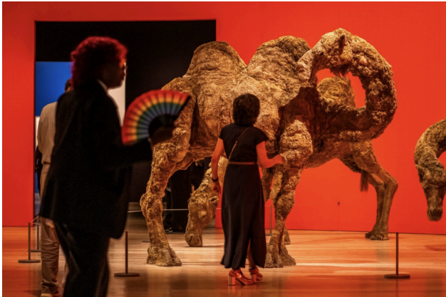
Installation view of Sixties Surreal (Whitney Museum of American Art, New York, September 24, 2025–Jan 19, 2026). Nancy Graves, Camel VI , Camel VII and Camel VIII , 1968–1969.

These images are approved only for publication in conjunction with the promotion of Sixties Surreal . Each image may not be cropped, bled off the page, colorized, solarized, overlaid with other matter (e.g., tone, text, another image, etc.), or otherwise altered, except as to overall size. Reproductions must include the full caption information adjacent to the image. Download high-resolution image files on the Whitney press site.