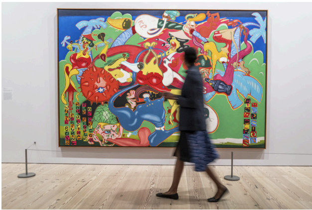
Installation view of Sixties Surreal (Whitney Museum of American Art, New York, September 24, 2025–Jan 19, 2026). Peter Saul, Saigon , 1967.