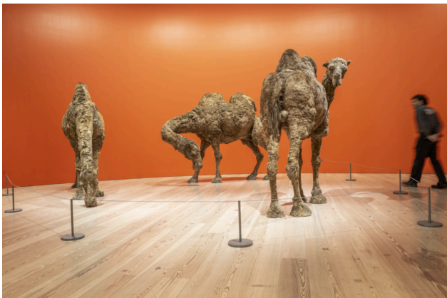
Installation view of Sixties Surreal (Whitney Museum of American Art, New York, September 24, 2025–Jan 19, 2026). Nancy Graves, Camel VI, Camel VII and Camel VIII, 1968–1969.