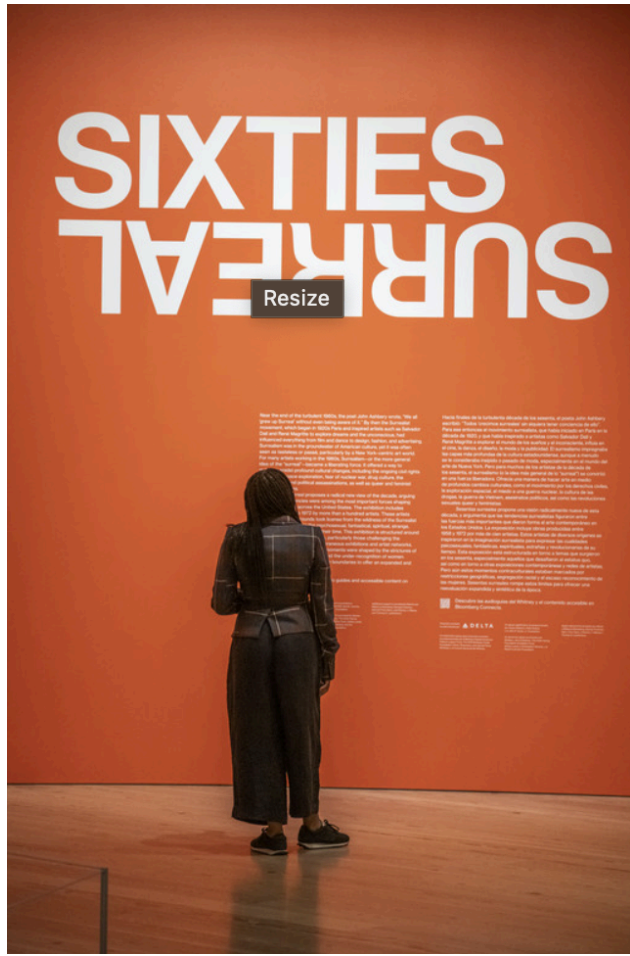
Installation view of Sixties Surreal (Whitney Museum of American Art, New York, September 24, 2025–Jan 19, 2026).