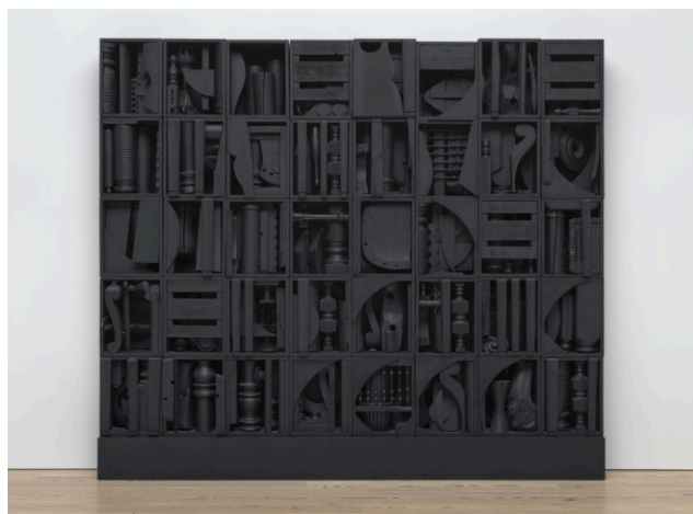
Louise Nevelson, Black Chord , 1964. Painted wood, 104 1/2 × 117 3/4 × 12 1/4 in. (265.4 × 299.1 × 31.1 cm). Whitney Museum of American Art, New York; gift of Anne and Joel Ehrenkranz 91.1a-e. © 2025 Estate of Louise Nevelson/Artists Rights Society (ARS), New York