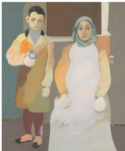
Arshile Gorky, The Artist and His Mother , 1926-c. 1936. Oil on canvas, 60 × 50 1/4 in. (152.4 × 127.6 cm). Whitney Museum of American Art, New York; gift of Julien Levy for Maro and Natasha Gorky in memory of their father 50.17. © 2025 The Arshile Gorky Foundation / Artists Rights Society (ARS), New York

These images are approved only for publication in conjunction with the promotion of (Untitled) America solarized, overlaid with other matter (e.g., tone, text, another image, etc.), or otherwise altered, except as to overall size. Reproductions must include the full caption information adjacent to the image. Download high-resolution image files on the Whitney press site.