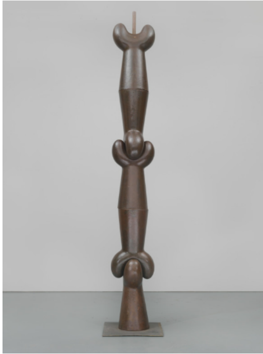
Isamu Noguchi, Endless Coupling , 1957. Cast iron, 100 1/8 × 17 15/16 × 18 1/4 in. (254.3 × 45.6 × 46.4 cm). Whitney Museum of American Art, New York; gift of Howard and Jean Lipman 78.72a-f. © 2025 The Isamu Noguchi Foundation and Garden Museum / Artists Rights Society (ARS), New York