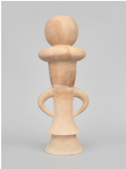
Isamu Noguchi, The Queen , 1931/c. 1943. Earthenware, 43 7/8 × 16 × 16 in. (111.4 × 40.6 × 40.6 cm). Whitney Museum of American Art, New York; gift of the artist 69.107a-c. © 2025 The Isamu Noguchi Foundation and Garden Museum / Artists Rights Society (ARS), New York