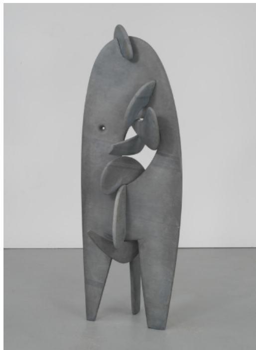
Isamu Noguchi, Humpty Dumpty , 1946. Ribbon slate, 59 × 20 3/4 × 17 1/2 in. (149.9 × 52.7 × 44.5 cm). Whitney Museum of American Art, New York; purchase 47.7a-e. © 2025 The Isamu Noguchi Foundation and Garden Museum / Artists Rights Society (ARS), New York