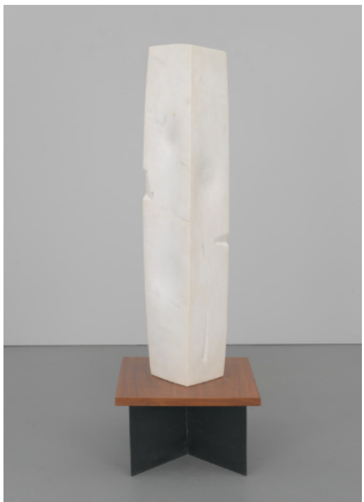
Isamu Noguchi, Integral , 1959. Marble on wood and steel base, 62 × 21 × 21 in. (157.5 × 53.3 × 53.3 cm). Whitney Museum of American Art, New York; purchase with funds from the Friends of the Whitney Museum of American Art 60.25a-e. © 2025 The Isamu Noguchi Foundation and Garden Museum / Artists Rights Society (ARS), New York