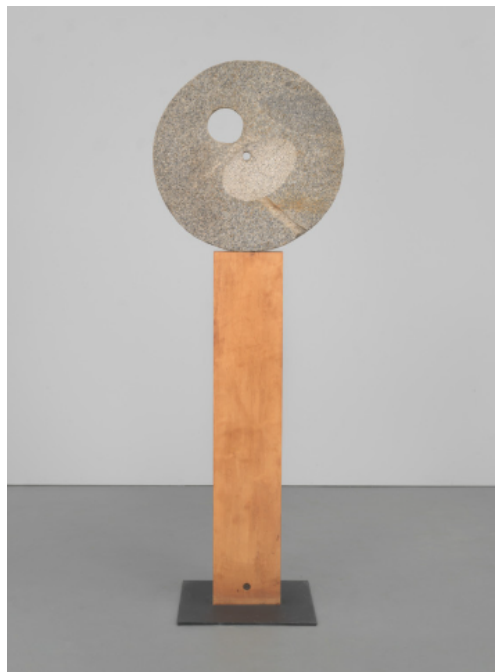
Isamu Noguchi, Variation on a Millstone #1 , 1962. Granite and wood, 24 7/8 × 24 7/8 × 4 in. (63.2 × 63.2 × 10.2 cm). Whitney Museum of American Art, New York; 50th Anniversary Gift of Mrs. Robert W. Benjamin 86.1. © 2025 The Isamu Noguchi Foundation and Garden Museum / Artists Rights Society (ARS), New York