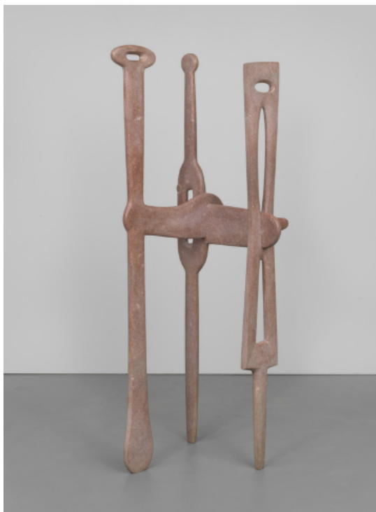
Isamu Noguchi, The Gunas , 1946. Marble, 73 3/4 × 26 1/4 × 25 1/2 in. (187.3 × 66.7 × 64.8 cm). Whitney Museum of American Art, New York; purchase with funds from the Howard and Jean Lipman Foundation, Inc. 75.18a-c. © 2025 The Isamu Noguchi Foundation and Garden Museum / Artists Rights Society (ARS), New York