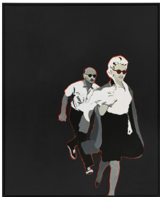
Rosalyn Drexler, Marilyn Pursued by Death , 1963. Acrylic and gelatin silver print on canvas, 49 7/8 × 40 in. (126.7 × 101.6 cm). Whitney Museum of American Art, New York; purchase with funds from the Painting and Sculpture Committee 2016.16. © 2025 Rosalyn Drexler / Artists Rights Society (ARS), New York and Garth Greenan Gallery, New York