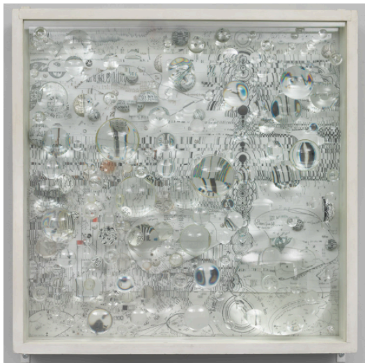
Mary Bauermeister, Homage to Marbert Du Breer , 1964. Glass, paper, wood, ink, and acrylic, 27 7/8 × 28 1/2 × 5 in. (70.8 × 72.4 × 12.7 cm). Whitney Museum of American Art, New York; purchase with funds from the Friends of the Whitney Museum of American Art 65.24. © 2025 Mary Bauermeister / Artists Rights Society (ARS), New York