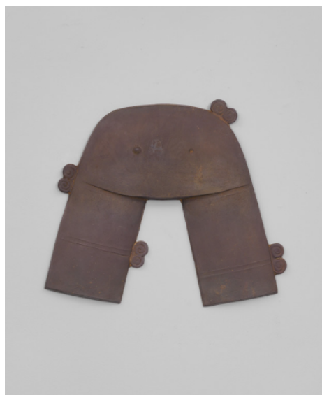
Isamu Noguchi, Celebration , c. 1952. Cast iron, 17 1/2 × 20 × 1 3/8 in. (44.5 × 50.8 × 3.5 cm). Whitney Museum of American Art, New York; gift of Howard and Jean Lipman 91.34.4. © 2025 The Isamu Noguchi Foundation and Garden Museum / Artists Rights Society (ARS), New York