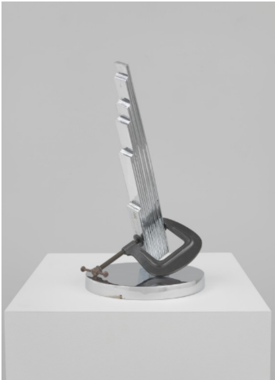
Man Ray, New York , 1917/1966. Nickel plated and painted bronze, 17 × 9 5/16 × 9 5/16 in. (43.2 × 23.7 × 23.7 cm). Whitney Museum of American Art, New York; purchase with funds from the Modern Painting and Sculpture Committee 96.174. © 2025 Man Ray Trust / Artists Rights Society (ARS), NY / ADAGP, Paris