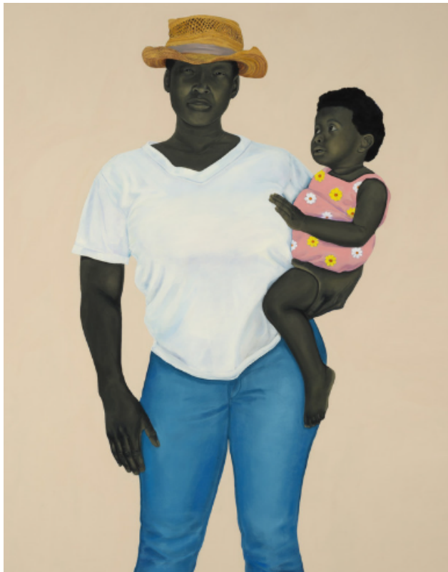
Amy Sherald, Mother and Child , 2016 Oil on canvas, 54 × 43 × 2 1/2 in. (137.16 × 109.22 × 6.35 cm). Courtesy The Blanchard Nesbitt Family. © Amy Sherald. Courtesy the artist and Hauser & Wirth.