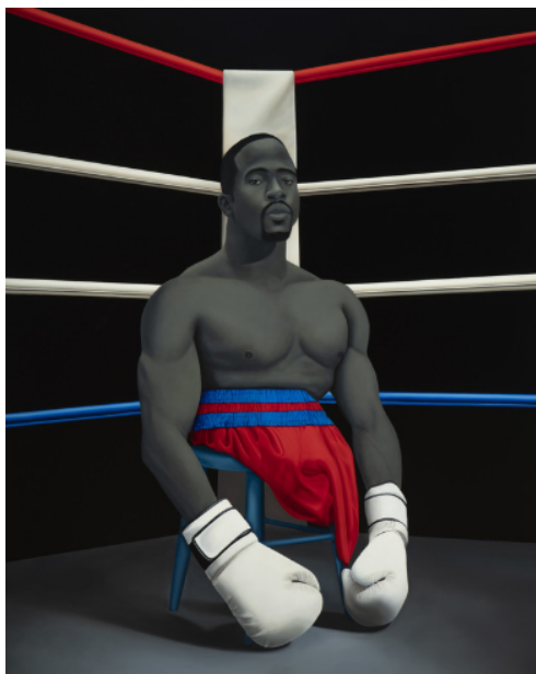
Amy Sherald, American Grit , 2024. Oil on linen, 95 x 76 1/2 x 2 1/2 in. (241.3 x 194.3 x 6.35 cm).