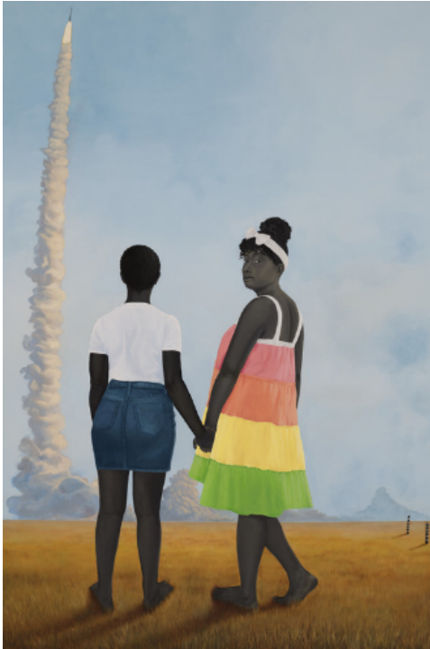
Amy Sherald, Planes, Rockets, and the Spaces in Between , 2018. Oil on canvas, 100 x 67 x 2 1/2 in. (254 x 170.1 x 6.35 cm). Baltimore Museum of Art, Purchase with exchange funds from the Pearlstone Family Fund and partial gift of The Andy Warhol Foundation for the Visual Arts, Inc., BMA 2018.80. © Amy Sherald. Courtesy the artist and Hauser & Wirth. Photograph by Joseph Hyde