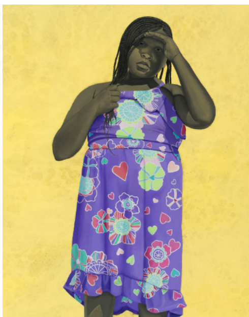
Amy Sherald, All Things Bright and Beautiful , 2016. Oil on canvas, 54 × 43 × 2 1/2 in. (137.16 × 109.22 × 6.35 cm). Collection of Frances and Burton Reifler. © Amy Sherald. Courtesy the artist and Hauser & Wirth. Photograph by Joseph Hyde