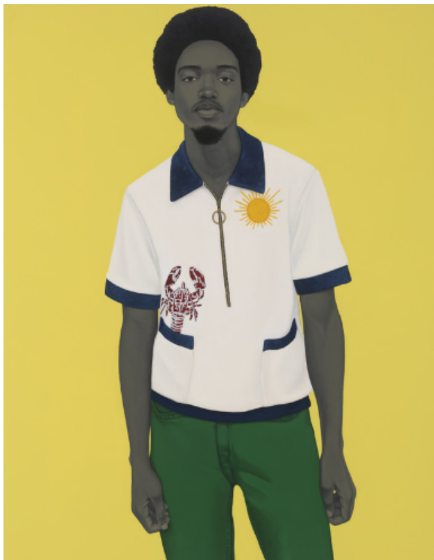
Amy Sherald, A Bucket Full of Treasures (Papa Gave Me Sunshine to Put in My Pocket) , 2020. Oil on linen, 54 × 43 × 2 1/2 in. (137.16 × 109.22 × 6.35 cm). Private collection. © Amy Sherald. Courtesy the artist and Hauser & Wirth. Photograph by Joseph Hyde