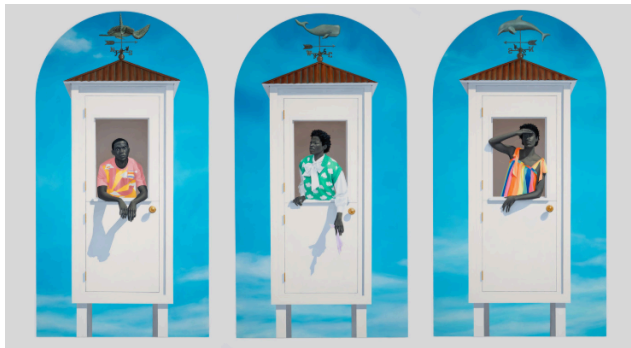
Amy Sherald Ecclesia (The Meeting of Inheritance and Horizons), 2024 Oil on linen, three panels 128 x 68 x 2.5in Collection of the artist; courtesy Hauser and Wirth