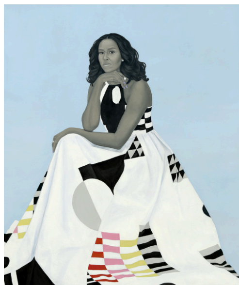
Amy Sherald, Michelle LaVaughn Robinson Obama , 2018. Oil on linen, 72 1/8 × 60 1/8 × 2 3/4 in. (183.1 × 152.7 × 7 cm). National Portrait Gallery, Smithsonian Institution. The National Portrait Gallery is grateful to the following lead donors for their support of the Obama portraits: Kate Capshaw and Steven Spielberg; Judith Kern and Kent Whealy; Tommie L. Pegues and Donald A. Capoccia.

These images are approved only for publication in conjunction with the promotion of Amy Sherald: American Sublime solarized, overlaid with other matter (e.g., tone, text, another image, etc.), or otherwise altered, except as to overall size. Reproductions must include the full caption information adjacent to the image. Download high-resolution image files on the Whitney press site.