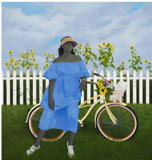
Amy Sherald, A Midsummer Afternoon Dream , 2021. Oil on canvas, 106 × 101 × 2 1/2 in. (269.24 × 256.54 × 6.35cm). Private Collection. © Amy Sherald. Courtesy the artist and Hauser & Wirth. Photograph by Joseph Hyde