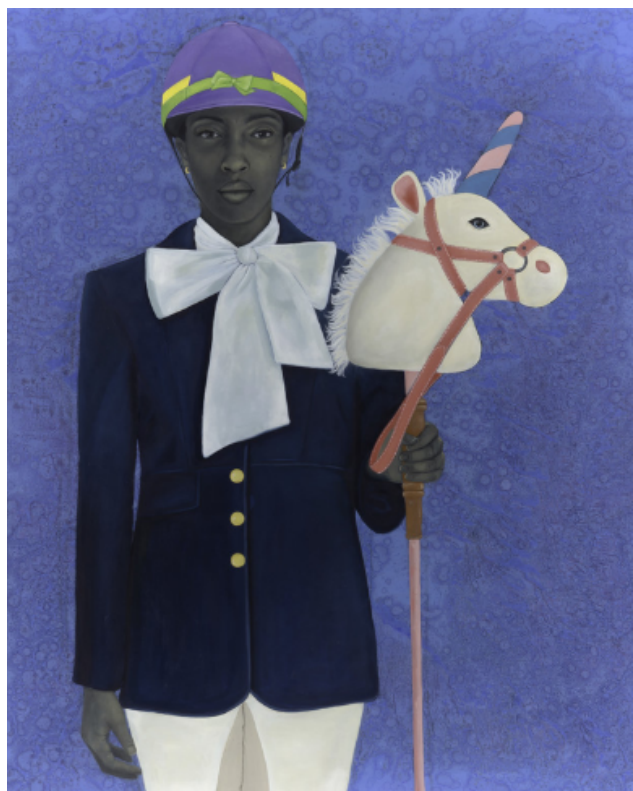
Amy Sherald, It Made Sense...Mostly in Her Mind , 2011. Oil on canvas, 54 × 43 × 2 1/2 in. (137.16 × 109.22 × 6.35 cm). Nancy and Sean Cotton Collection. © Amy Sherald. Courtesy the artist and Hauser & Wirth. Photograph by Lowy Art Services