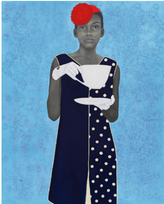
Amy Sherald, Miss Everything (Unsuppressed Deliverance) , 2014. Oil on canvas, 54 × 43 × 2 1/2 in. (137.16 × 109.22 × 6.35 cm). Private Collection. © Amy Sherald. Courtesy the artist and Hauser & Wirth. Photograph by Joseph Hyde