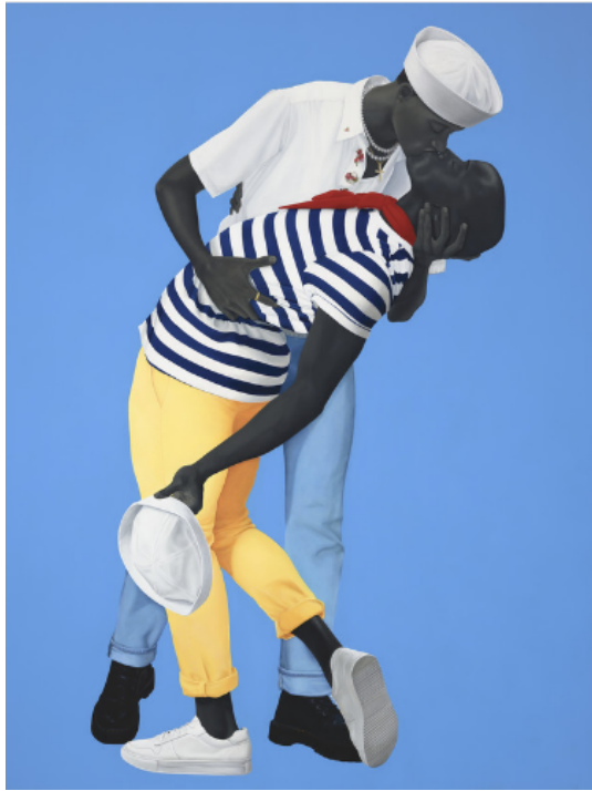
Amy Sherald, For Love, and for Country , 2022. Oil on linen, 123 1/4 × 93 1/8 × 2 1/2 in. (313 × 236.5 × 6.4 cm). San Francisco Museum of Modern Art, Purchase, by exchange, through a gift of Helen and Charles Schwab. © Amy Sherald. Courtesy the artist and Hauser & Wirth. Photograph by Joseph Hyde