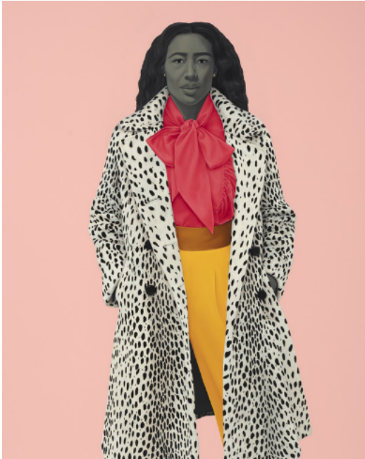
Amy Sherald, As Soft as She Is... , 2022. Oil on linen, 54 × 43 × 2 1/2 in. (137.16 × 109.22 × 6.35 cm). Tate, purchased with funds provided by the Tymure Collection. © Amy Sherald. Courtesy the artist and Hauser & Wirth. Photograph by Joseph Hyde