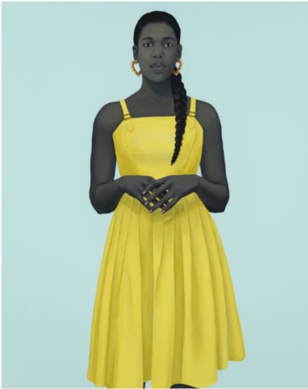
Amy Sherald, Untitled (Opal) , 2019, Oil on linen, 54 × 43 × 2 1/2 in. (137.16 × 109.22 × 6.35 cm). Collection of Robert F. Smith. © Amy Sherald. Courtesy the artist and Hauser & Wirth. Photograph by Joseph Hyde