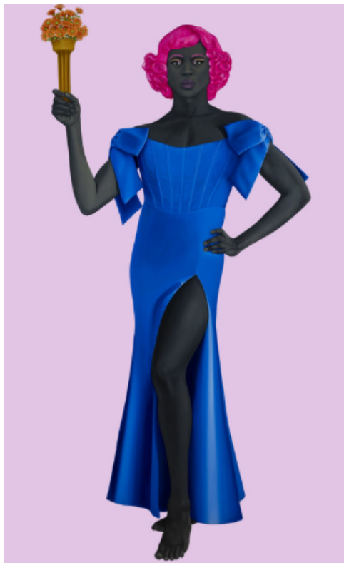
Amy Sherald, Trans Forming Liberty , 2024. Oil on linen, 123 × 76 1/2 × 2 1/2 in. (312.4 × 194.3 × 6.35 cm).