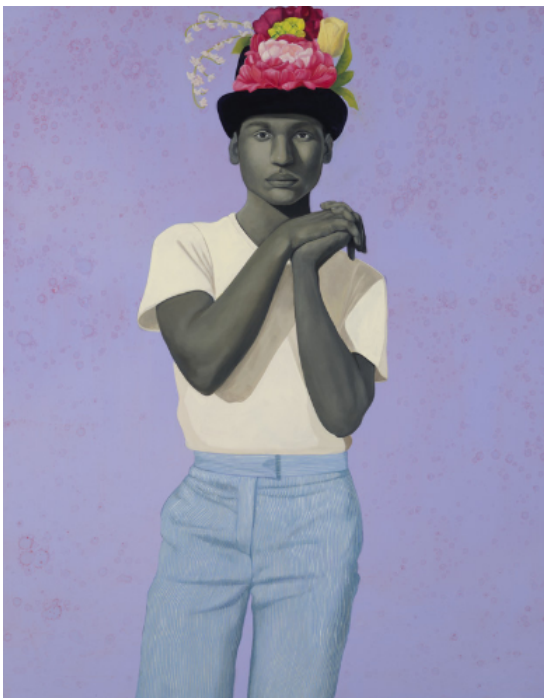
Amy Sherald, Try on dreams until I find the one that fits me. They all fit me , 2017. Oil on canvas, 54 × 43 × 2 1/2 in. (137.16 × 109.22 × 6.35 cm). Kemper Museum of Contemporary Art, Kansas City, Missouri, Museum purchase made possible by a gift from the Bebe and Crosby Kemper Foundation. © Amy Sherald.