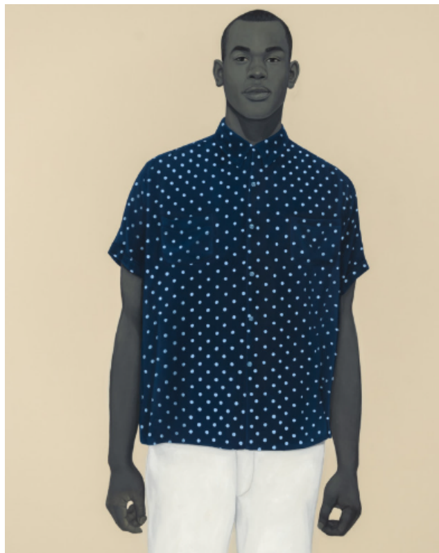
Amy Sherald, Handsome , 2019. Oil on canvas, 54 × 43 × 2 1/2 in. (137.16 × 109.22 × 6.35 cm). Collection of Anderson Cooper. © Amy Sherald.