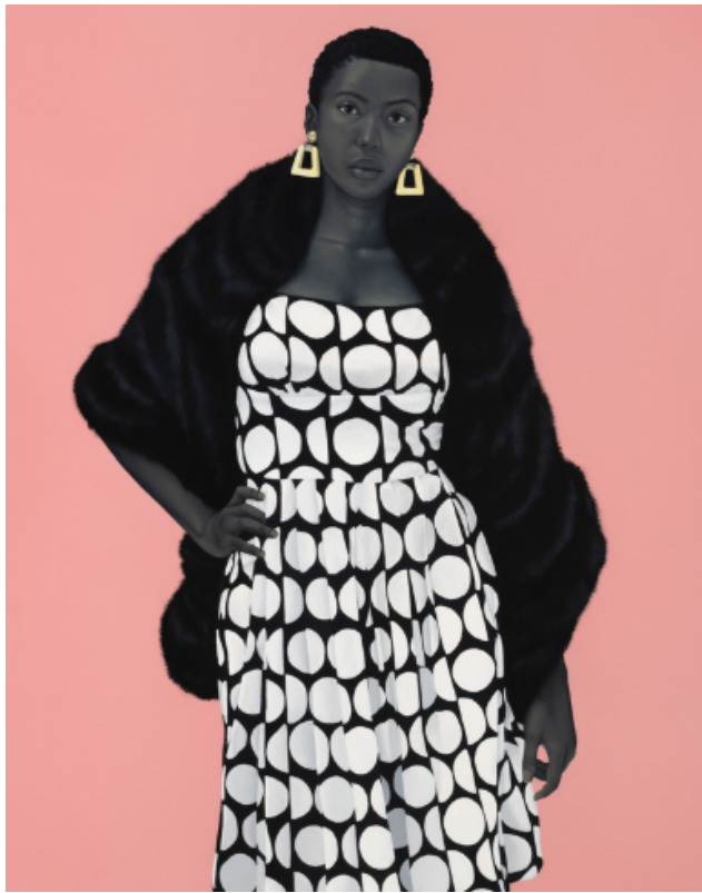
Amy Sherald, Mama Has Made the Bread (How Things Are Measured) , 2018. Oil on canvas, 54 × 43 × 2 1/2 in. (137.16 × 109.22 × 6.35 cm). Private collection. © Amy Sherald. Courtesy the artist and Hauser & Wirth. Photograph by Joseph Hyde