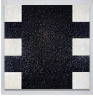
Untitled (Black Light Painting) , 1975 Acrylic squares, glass microspheres, and acrylic on canvas 108 x 108 in. (274.3 x 274.3 cm) Collection of Sangbeom Kim and Sunjung Kim