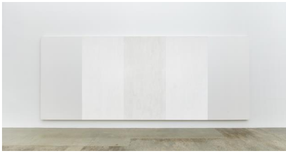
Untitled (White Inner Band), 2003

Glass microspheres and acrylic on canvas