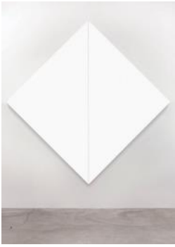
Untitled (White Diamond, Negative Stripe) , 1965 Acrylic on canvas 84 x 84 in. (213.36 x 213.36 cm) Collection of Michael Straus