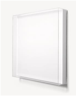
Untitled (Space Plexi + Painted Wood) , 1966 Plexiglass and acrylic on composition board 24 3/8 x 24 3/8 x 4 1/8 in. (61 x 61 x 6.4 cm) Collection of Andrea Nasher