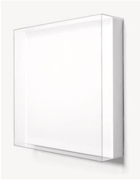
Untitled (Space Plexi + Painted Wood) , 1966 Plexiglass and acrylic on composition board 24 1/4 x 24 1/4 x 5 7/8 in. (61 x 61 x 6.4 cm) Collection of Andrea Nasher