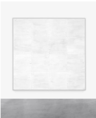
Untitled (White Grid, Horizontal Strokes) , 1969 Glass microspheres and acrylic on canvas 108 x 108 in. (274.3 x 274.3 cm) Collection of the artist; courtesy Kayne Griffin Corcoran, Los Angeles; Lehmann Maupin, New York; and Lisson Gallery, London