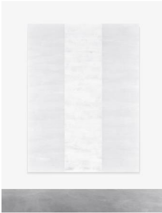
Untitled (White Inner Band, Beveled), 2011

Collection of the artist; courtesy Kayne Griffin Corcoran, Los Angeles; Lehmann Maupin, New York; and Lisson Gallery, London