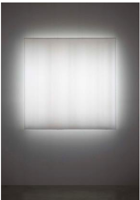
Untitled (Space + Electric Light) , 1968 Argon light, plexiglass, and high-frequency generator 45 1/4 x 45 1/4 x 4 3/4 in. (114.9 x 114.9 x 12.1 cm) Museum of Contemporary Art San Diego; Museum purchase with funds from the Annenberg Foundation