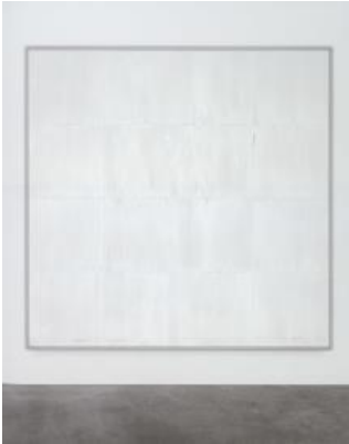
Untitled (White Grid, Vertical Strokes) , 1969 Glass microspheres and acrylic on canvas 108 x 108 in. (274.3 x 274.3 cm) Collection of Andrea Nasher