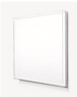
Untitled (Space Plexi + Painted Wood) , 1966 Plexiglass and acrylic on composition board 24 5/16 x 24 5/16 x 2 5/8 in. (61 x 61 x 6.4 cm) Collection of Andrea Nasher