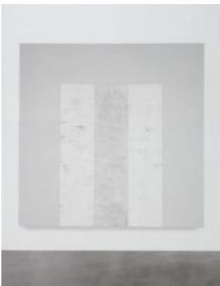
Untitled (White Arch Inner Band Series) , 1996 Glass microspheres and acrylic on canvas 96 1/2 x 96 in. (245.1 x 243.8 cm) Los Angeles County Museum of Art; Modern and Contemporary Art Council, New Talent Purchase Award by exchange M.2007.99