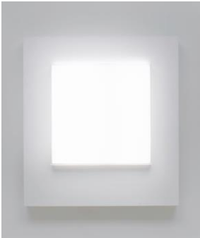
Untitled (White Light Series) , 1966 Fluorescent light, plexiglass, and acrylic on wood 72 x 66 x 11 in. (182.9 x 167.6 x 27.9 cm) Solomon R. Guggenheim Museum, New York; gift, Michael Straus, 2016