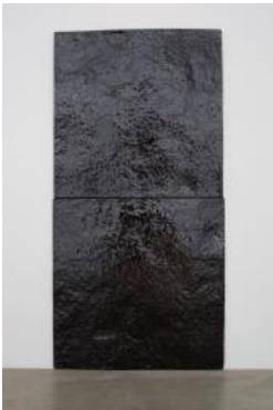
Untitled (Black Earth Series) , 1978 Ceramic, two tiles 96 x 48 in. (243.8 x 121.9 cm) (overall) Collection of the artist; courtesy Kayne Griffin Corcoran, Los Angeles; Lehmann Maupin, New York; and Lisson Gallery, London