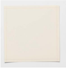
Untitled , 1965 Screenprint 7 5/8 x 7 5/8 in. (19.4 x 19.4 cm) Edition: 25 (two examples) Collection of the artist; courtesy Kayne Griffin Corcoran, Los Angeles; Lehmann Maupin, New York; and Lisson Gallery, London