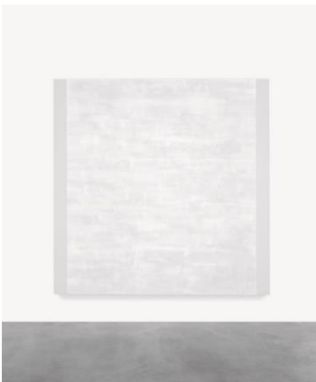
Untitled (White Light Band Series) , 1991 Glass microspheres and acrylic on canvas 96 x 96 in. (243.8 x 243.8 cm) Collection of Kayne Griffin Corcoran, Los Angeles