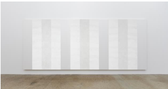
Untitled (White Multiple Inner Band), 2003

Glass microspheres and acrylic on canvas