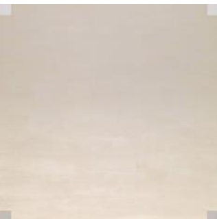
Untitled (Light Painting) , 1971 Glass microspheres and acrylic on canvas 96 x 96 in. (243.8 x 243.8 cm) Solomon R. Guggenheim Museum, New York; gift, The Theodoron Foundation, 1971