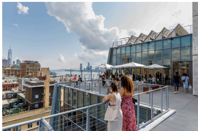
Whitney Museum of American Art.