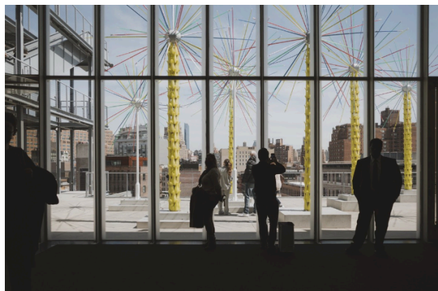
Installation view of Whitney Biennial 2022: Quiet as It's Kept (Whitney Museum of American Art, New York, April 6–September 5, 2022). Alia Farid, Palm Orchard , 2022.