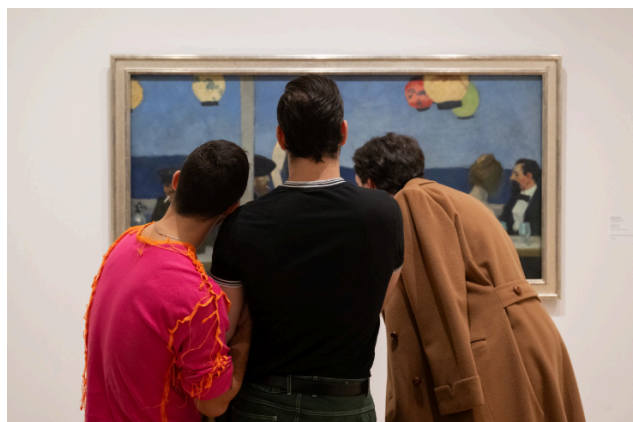
Installation view of The Whitney's Collection: Selections from 1900 to 1965 (Whitney Museum of American Art, New York, June 28, 2019- ). Edward Hopper, Soir Bleu , 1914.