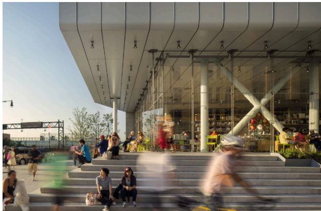
Whitney Museum of American Art.