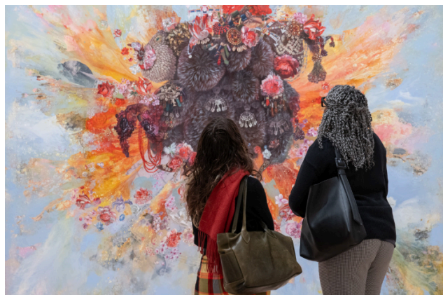
Installation view of Shifting Landscapes (Whitney Museum of American Art, New York, November 1, 2024-January 2026). Firelei Báez, Untitled (Tabula Anemographica seu Pyxis Navtic) , 2021.