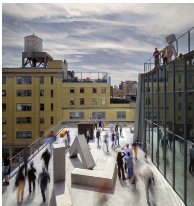
Installation view of America Is Hard to See (Whitney Museum of American Art, May 1-September 27, 2015). From front to back: Robert Morris, Untitled (3 Ls) , 1965; Tony Smith, Die , 1962; David Smith, Cubi XXI , 1964.

These images are approved only for publication in conjunction with the promotion of Decade Downtown solarized, overlaid with other matter (e.g., tone, text, another image, etc.), or otherwise altered, except as to overall size. Reproductions must include the full caption information adjacent to the image. Download high-resolution image files on the Whitney press site.