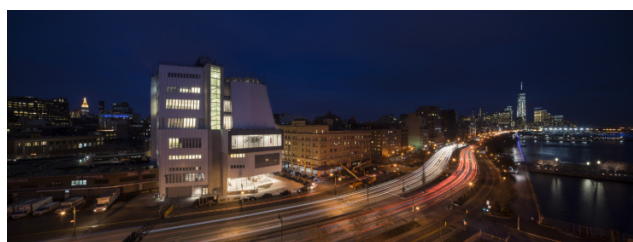
Whitney Museum of American Art.