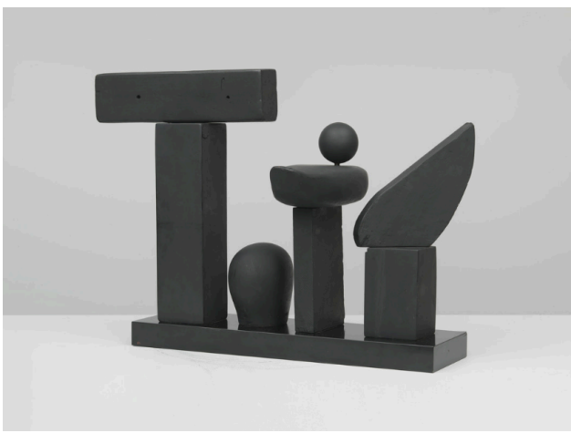
Louise Nevelson, Black Majesty , 1955. Painted wood and plywood, 28 × 38 1/4 × 16 1/8 in. (71.1 × 97.2 × 41 cm). Whitney Museum of American Art, New York; gift of Mr. and Mrs. Ben Mildwoff through the Federation of Modern Painters and Sculptors, Inc. 56.11. © 2025 Estate of Louise Nevelson/Artists Rights Society (ARS), New York