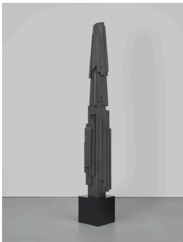
Louise Nevelson, Rain Forest Column XXIII , 1964–67. Painted wood and steel, 81 3/8 × 11 1/4 × 10 3/4 in. (206.7 × 28.6 × 27.3 cm). Whitney Museum of American Art, New York; gift of the artist 69.218. © 2025 Estate of Louise Nevelson/Artists Rights Society (ARS), New York