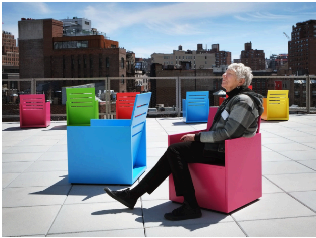
Updated caption: Artist Mary Heilmann on the Terrace. Installation view of Mary Heilmann: Sunset (Whitney Museum of American Art, New York, May 1, 2015–September 27, 2015).