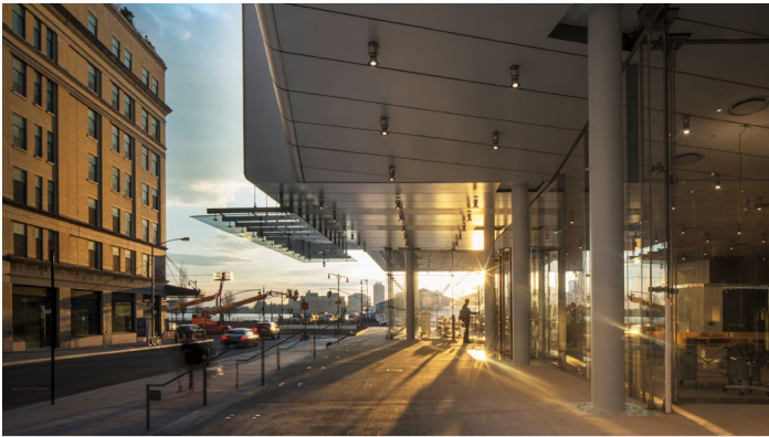
Floor 1 Pamella and Daniel DeVos Family Largo Square footage: 8,500 Maximum capacity: n/a

Commercial Filming and Photography is subject to Corporate Fees, Location Fees and Licensing. Estimates are available upon request.