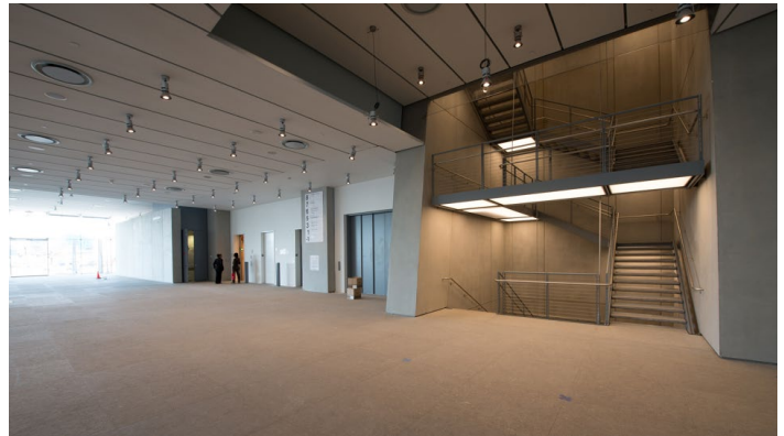
Floor 1 Kenneth C. Griffin Hall Square footage: 6,200 Maximum capacity: 550