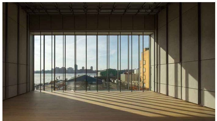
Floor 3 Susan and John Hess Family Theater Square footage: 2,450 Maximum capacity: 180