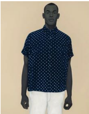
Amy Sherald Handsome , 2019 Oil on canvas 54 x 43 x 2.5in Collection of Anderson Cooper