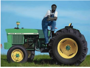
Amy Sherald A God Blessed Land (Empire of Dirt) , 2022 Oil on linen 96 1/8 x 130 1/8 x 2.5in