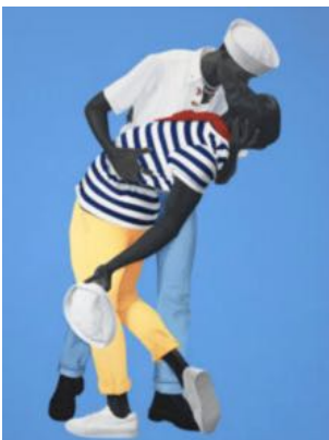
Amy Sherald For Love, and for Country , 2022 Oil on linen 123 1/4 x 93 1/8 x 2.5in San Francisco Museum of Modern Art; purchase, by exchange, through a gift of Helen and Charles Schwab