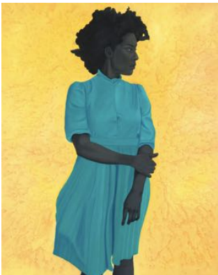
Amy Sherald Saint Woman , 2015 Oil on canvas 54 x 43 x 2.5in Private collection; courtesy Monique Meloche Gallery and Hauser and Wirth