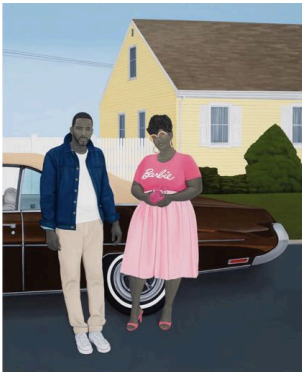
Amy Sherald As American as apple pie , 2021 Oil on canvas Overall: 123 x 101 x 2 5/8in. (312.4 x 256.5 x 6.7 cm) Private Collection