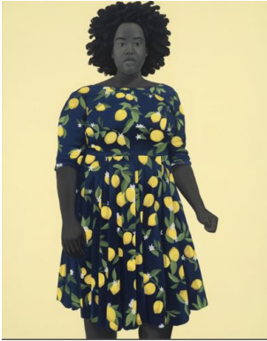
Amy Sherald She Always Believed the Good about Those She Loved , 2018 Oil on canvas 54 x 43 x 2.5in