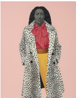
Amy Sherald As Soft as She Is... , 2022 Oil on canvas 54 1/8 x 43 1/8 x 2.5in Private collection