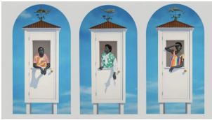
Amy Sherald Ecclesia (The Meaning of Inheritance and Horizons) , 2024 Oil on linen, three panels 128 x 68 x 2.5in Collection of the artist; courtesy Hauser and Wirth