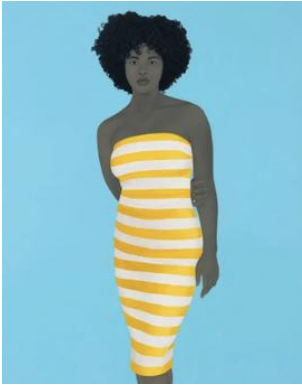
Amy Sherald There is no charm equal to tenderness of heart , 2019 Oil on canvas 54 x 43 x 2.5in Private collection