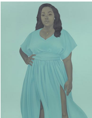
Amy Sherald Breonna Taylor , 2020 Oil on linen 54 x 43 x 2.5in The Speed Art Museum, Louisville, Kentucky; purchase made possible by a grant from the Ford Foundation; and the Smithsonian National Museum of African American History and Culture, purchase made possible by a gift from Kate Capshaw and Steven Spielberg