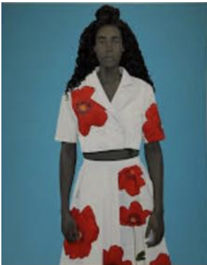
Amy Sherald In the Garden of Herself , 2024 Oil on linen 54 1/8 x 43 1/8 x 2.5in Collection of the artist; courtesy Hauser and Wirth