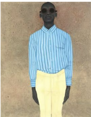
Amy Sherald The Boy with No Past , 2014 Oil on canvas 54 x 43 x 2.5in Private Collection