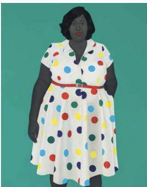
Amy Sherald The Girl Next Door , 2019 Oil on canvas 54 x 43 x 2.5in Private collection