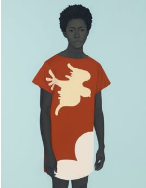
Amy Sherald Hope Is the Thing with Feathers (The Little Bird) , 2020 Oil on linen 54 x 43 x 2.5in Collection of the artist; courtesy Hauser and Wirth