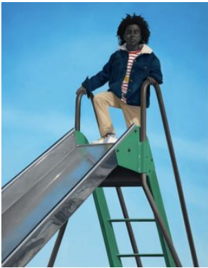
Amy Sherald Kingdom , 2022 Oil on linen 117 1/8 x 92 x 2.5in The Broad Art Foundation, Los Angeles