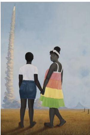
Amy Sherald Planes, Rockets, and the Spaces in Between , 2018 Oil on canvas 100 x 67 x 2.5in Baltimore Museum of Art; purchase with exchange funds from the Pearlstone Family Fund and partial gift of The Andy Warhol Foundation for the Visual Arts Inc.