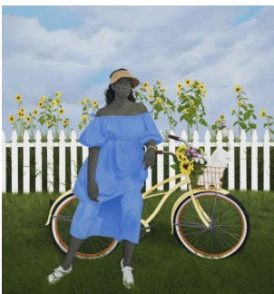
Amy Sherald A Midsummer Afternoon Dream , 2020 Oil on canvas 106 x 101 x 2.5in Private Collection