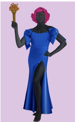
Amy Sherald Trans Forming Liberty , 2024 Oil on canvas 123 x 76.5 x 2.5in Collection of the artist