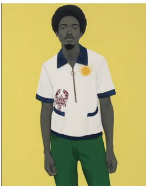
Amy Sherald A bucket full of treasures (Papa gave me sunshine to put in my pockets...) , 2020 Oil on linen 54 x 43 x 2.5in Private collection