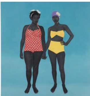
Amy Sherald The Bathers , 2015 Oil on canvas 74 x 72 x 2.5in Private Collection