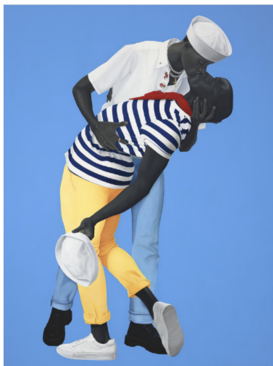
Amy Sherald, For Love, and for country , 2022. Oil on linen, 123 1/4 × 93 1/8 × 2 1/2 in. (313 × 236.5 × 6.4 cm). San Francisco Museum of Modern Art, purchase, by exchange, through a gift of Helen and Charles Schwab. © Amy Sherald. Courtesy the artist and Hauser & Wirth. Photograph by Joseph Hyde