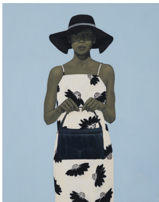
Amy Sherald, Listen, you a wonder. You a city of a woman. You got a geography of your own , 2016. Oil on canvas, 54 × 43 × 2.5 in. (137.16 × 109.22 × 6.35 cm). Collection of Rashid Johnson and Sheree Hovsepian. © Amy Sherald. Courtesy the artist and Hauser & Wirth. Photograph by Joseph Hyde