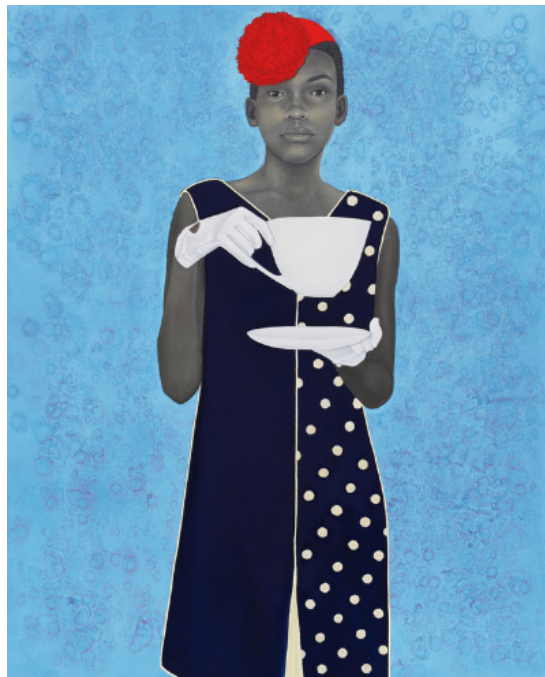
Amy Sherald, Miss Everything (Unsuppressed Deliverance) , 2014. Oil on canvas, 54 × 43 × 2.5 in. (137.16 × 109.22 × 6.35 cm). Private Collection. © Amy Sherald. Courtesy the artist and Hauser & Wirth. Photograph by Joseph Hyde