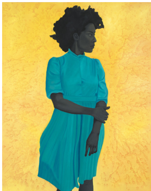
Amy Sherald, Saint Woman , 2015. Oil on canvas, 54 × 43 × 2.5 in. (137.16 × 109.22 × 6.35 cm). Private collection. Courtesy Monique Meloche Gallery and Hauser & Wirth. © Amy Sherald. Courtesy the artist and Hauser & Wirth. Photograph by Joseph Hyde