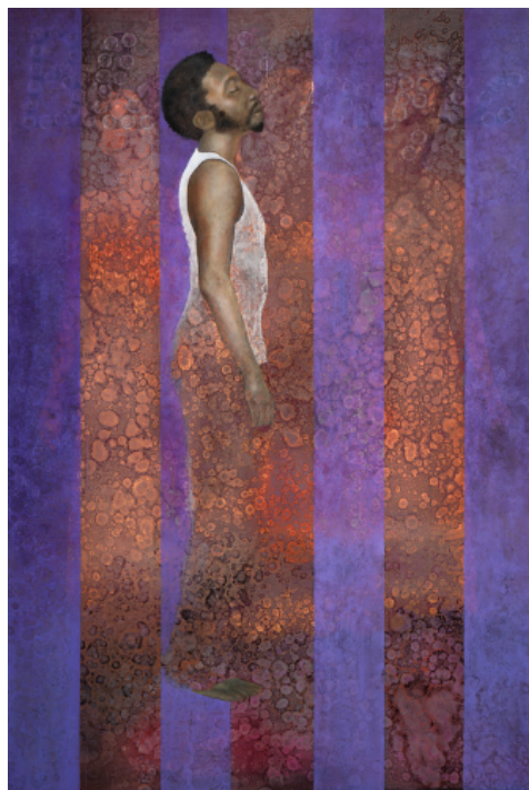
Amy Sherald, Hangman , 2007. Oil on canvas, 100 × 67 × 2.5 in. (254 × 170.18 × 6.35 cm). Collection of Sheryll Cashin and Marque Chambliss. © Amy Sherald. Courtesy the artist and Hauser & Wirth. Photograph by Kelvin Bulluck