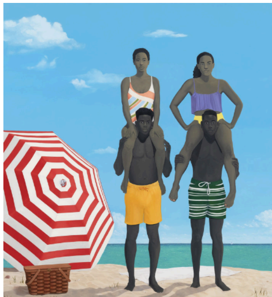
Amy Sherald, Precious Jewels by the Sea , 2019, oil on linen, 120 × 108 × 2 1/2 in. (304.8 × 274.32 × 6.355 cm). Crystal Bridges Museum of American Art, Bentonville, Arkansas. © Amy Sherald.