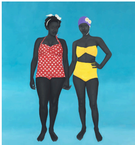
Amy Sherald, The Bathers , 2015. Oil on canvas, 72 1/8 × 67 × 2.5 in. (183.2 × 170.2 cm). Private Collection. © Amy Sherald.