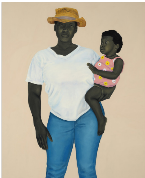
Amy Sherald, Mother and Child , 2016 Oil on canvas, 54 × 43 × 2.5 in. (137.16 × 109.22 × 6.35 cm). Courtesy The Blanchard Nesbitt Family. © Amy Sherald. Courtesy the artist and Hauser & Wirth. Photograph by Joseph Hyde