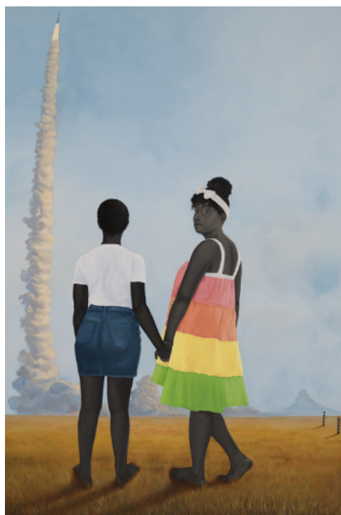
Amy Sherald, Planes, Rockets, and the Spaces in Between , 2018. Oil on canvas, 100 × 67 × 2.5 in. (254 × 170.1 × 6.35 cm). Baltimore Museum of Art, Purchase with exchange funds from the Pearlstone Family Fund and partial gift of The Andy Warhol Foundation for the Visual Arts, Inc. © Amy Sherald. Courtesy the artist and Hauser & Wirth. Photograph by Joseph Hyde