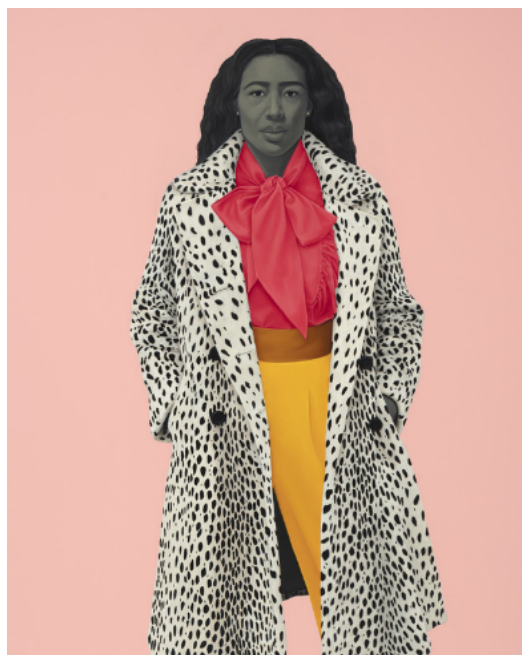
Amy Sherald, As Soft as She Is... , 2022. Oil on linen, 54 1/8 × 43 1/8 × 2.5 in. (137.16 × 109.22 × 6.35 cm). Tate, purchased with funds provided by the Tymure Collection. © Amy Sherald. Courtesy the artist and Hauser & Wirth. Photograph by Joseph Hyde