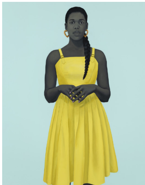
Amy Sberald, Untitled (Opal) , 2019, Oil on linen, 54 × 43 × 2.5 in. (137.16 × 109.22 × 6.35 cm). Collection of Robert F. Smith. © Amy Sberald.