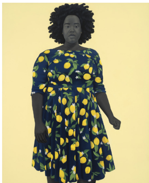
Amy Sberald, She Always Believed the Good about Those She Loved , 2018. Oil on canvas, 54 × 43 × 2.5 in. (137.16 × 109.22 × 6.35 cm). Private collection, courtesy Monique Meloche Gallery. © Amy Sberald. Courtesy the artist and Hauser & Wirth. Photograph by Joseph Hyde