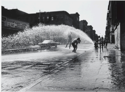
Hiram Maristany, Hydrant: In the Air , 1963, printed 2021. Gelatin silver print, 16 × 20 in. (40.6 × 50.8 cm). Whitney Museum of American Art, New York; purchase with funds from the Photography Committee 2022.61. © Hiram Maristany