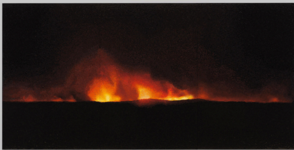
Teresita Fernández, Fire (America) 3 , 2016. Glazed ceramic, 72 × 144 × 1 1/4 in. (182.9 × 365.8 × 3.2 cm). Whitney Museum of American Art, New York; purchase with funds from the Painting and Sculpture Committee 2021.19a-c. © Teresita Fernández