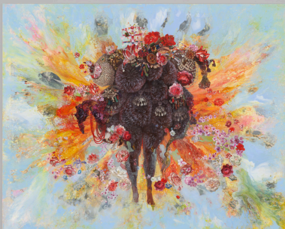
Firelei Báez, Untitled (Tabula Anemographica seu Pyxis Navtic) , 2021. Acrylic and oil on archival printed canvas, 89 7/8 × 111 7/8 × 1 1/2 in. (228.3 × 284.2 × 3.8 cm). Whitney Museum of American Art, New York; purchase with funds from Chrissy Taylor and Lee Broughton 2022.104. © Firelei Báez