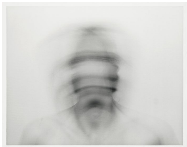
Blythe Bohnen, Pivotal Motion From Chin, Large , 1974. Gelatin silver print: sheet, 15 7/8 × 19 13/16 in. (40.3 × 50.3 cm); image, 14 7/8 × 18 15/16 in. (37.8 × 48.1 cm). Whitney Museum of American Art, New York; gift of Paula and Herbert R. Molner 2003.11. © Estate of Blythe Bohnen