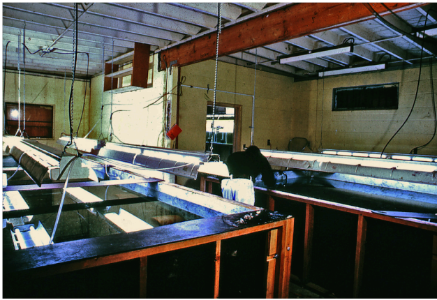
The Harrisons, Survival Piece VII: The Crab Farm, 1972-1973. (installation view, University of California, San Diego, CA). Dimensions variable.