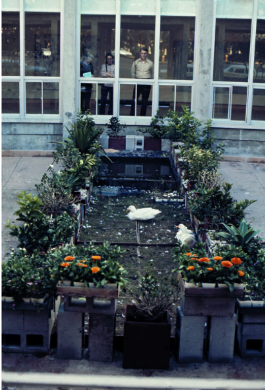
The Harrisons, Survival Piece IV: La Jolla Promenade , 1971 (installation view, Museum of Contemporary Art, San Diego). Dimensions variable. © Helen and Newton Harrison Family Trust. Courtesy Various Small Fires, Los Angeles/Dallas/Seoul