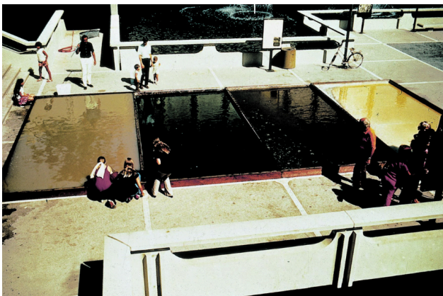
The Harrisons, Survival Piece II: Notations on the Ecosystem of the Western Saltworks with the Inclusion of Brine Shrimp , 1972 (installation view from the Los Angeles County Museum of Art). Dimensions variable. © Helen and Newton Harrison Family Trust.