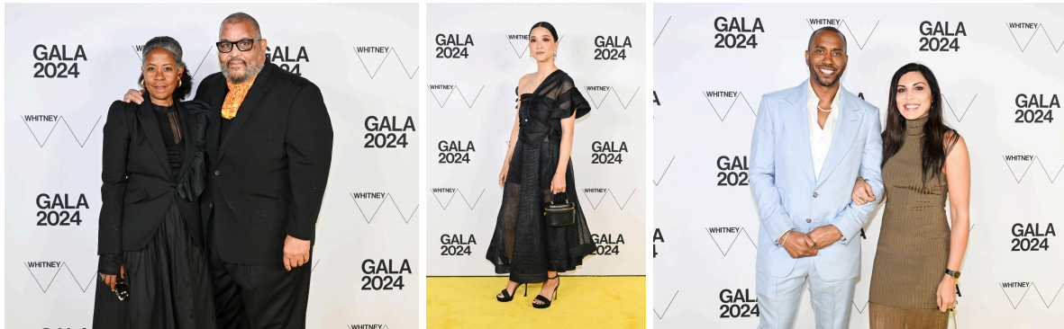
From left to right: Torkwase Dyson, Dawoud Bey; Christine Sun Kim; Rashid Johnson, Sheree Hovsepian