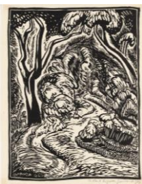
Country Road , 1925