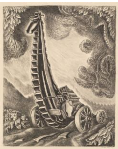
Stone Crusher, 1929