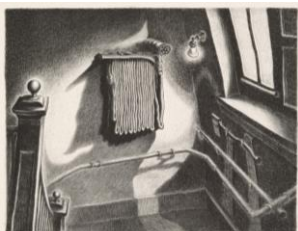
Macy's Stairway , 1940–41 Lithograph 11 7/8 x 16 1/16 in. (30.2 x 40.8 cm) Purchase, with funds from The Lauder Foundation, Leonard and Evelyn Lauder Fund 96.68.123