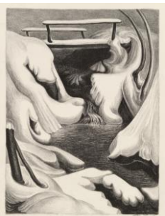
Snow Drifts , 1934 Lithograph 10 13/16 x 8 5/16 in. (27.5 x 21.1 cm) Purchase, with funds from The Lauder Foundation, Leonard and Evelyn Lauder Fund 96.68.120