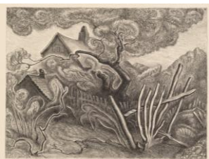
Spring in the Garden , 1927

Purchase, with funds from The Lauder Foundation, Leonard and Evelyn Lauder Fund 96.68.107