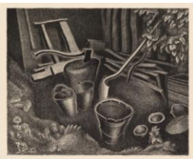
Backyard Corner, 1930

Purchase, with funds from The Lauder Foundation, Leonard and Evelyn Lauder Fund 96.68.113