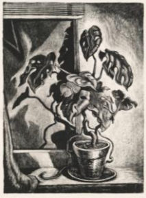
Philodendron Pertusum , 1944 (printed 1947) Lithograph 15 11/16 x 12 1/8 in. (39.8 x 30.8 cm) Purchase, with funds from The Lauder Foundation, Leonard and Evelyn Lauder Fund 96.68.125