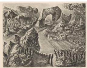
Gumbo Lane , 1927