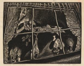
Christmas at Tumble Timbers, 1928