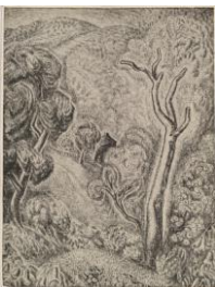
Upright Landscape , 1926

Gift of Gertrude Vanderbilt Whitney 31.731