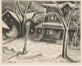
Winter Twilight, 1927