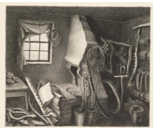
The Forge , 1932 Lithograph 13 3/4 x 18 3/8 in. (34.9 x 46.7 cm) Purchase 32.103