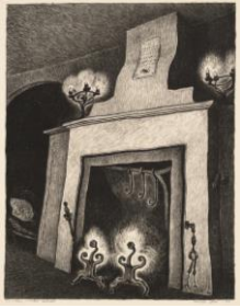
Fireplace , 1930 Lithograph 12 1/4 x 9 5/8 in. (31.1 x 24.4 cm) Purchase, with funds from The Lauder Foundation, Leonard and Evelyn Lauder Fund 96.68.117