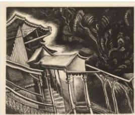
Elevated Station , 1926