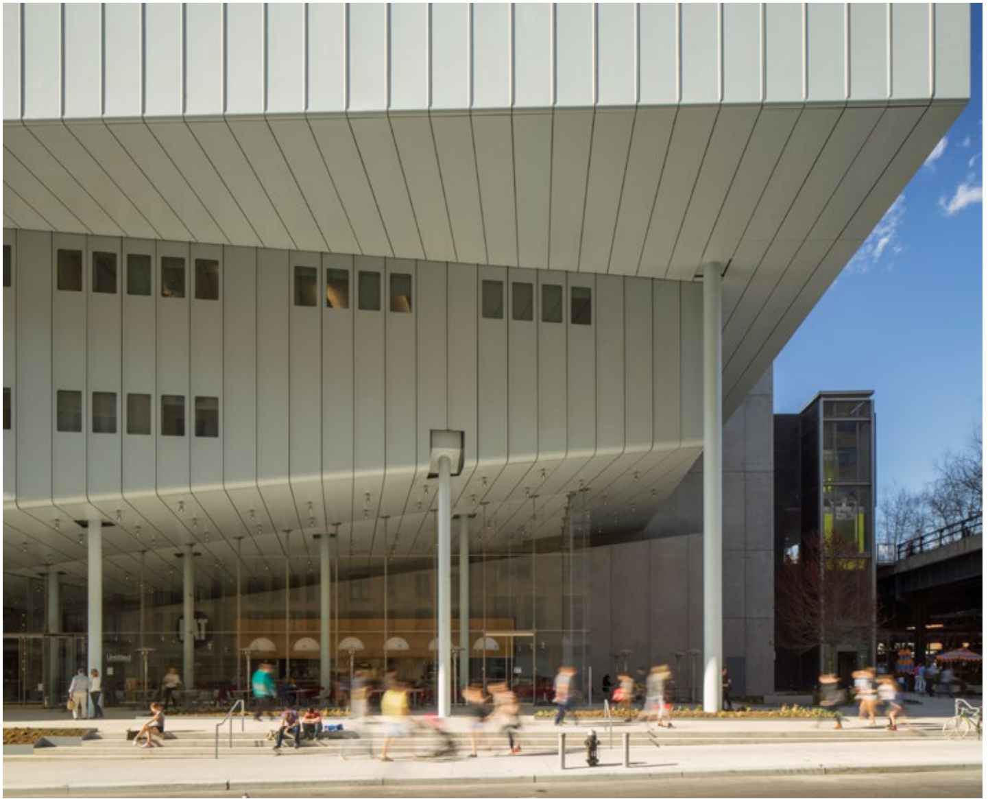
Museum exterior.

Today we are going to the Whitney Museum with our class. It is an art museum. We will be at the Museum for about seventy minutes. While we are there we will look at art and have fun!