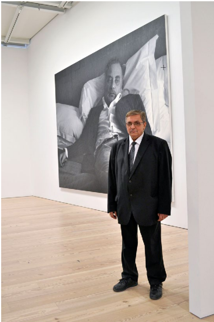
Guard in the gallery.

There are Guards in the galleries. They are there to keep us safe and to keep the art safe.