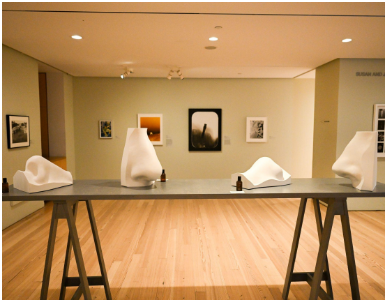
From left to right: Welcoming guests upon arrival with flutes of Casa Dragones Joven Sipping Tequila; Aesop fragrance activation in the galleries on floor 3.