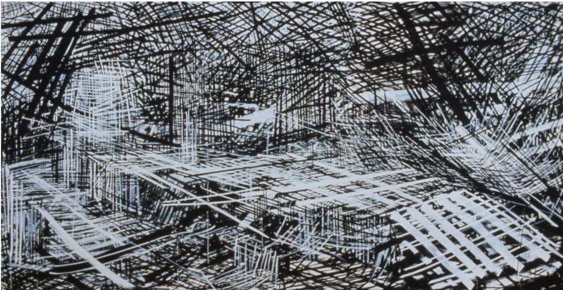
Denyse Thomasos, Displaced Burial / Burial at Gorée , 1993. Acrylic on canvas, 108 × 216 in. (274.3 × 548.6 cm).

The 2022 Biennial features dynamic contributions that take different forms over the course of the presentation: artworks—even walls—change, and performance animates the galleries and objects. With a roster of artists at all points in their careers, the Biennial surveys the art of these times through an intergenerational group, many with an interdisciplinary perspective, and the curators have chosen not to have a separate performance or video and film program. Rather, these forms are integrated into the exhibition with an equal and consistent presence in the galleries.