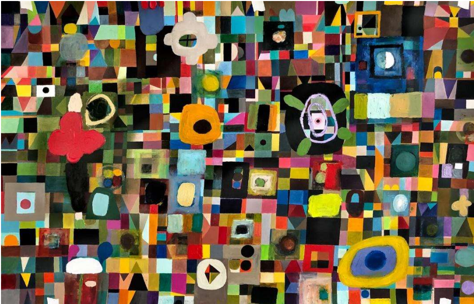
Ralph Lemon, Untitled , 2021. Oil and acrylic on paper, 26 × 40 in. (66.1 × 101.6 cm).