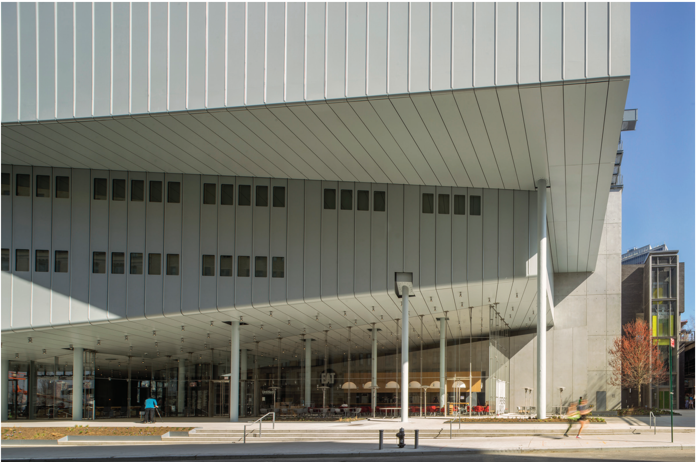
Whitney Museum of American Art.

Today we are going to go to an art museum with our family. We will be at the Museum for about one and a half hours. While we are there we will look at art, make our own art, and have fun.