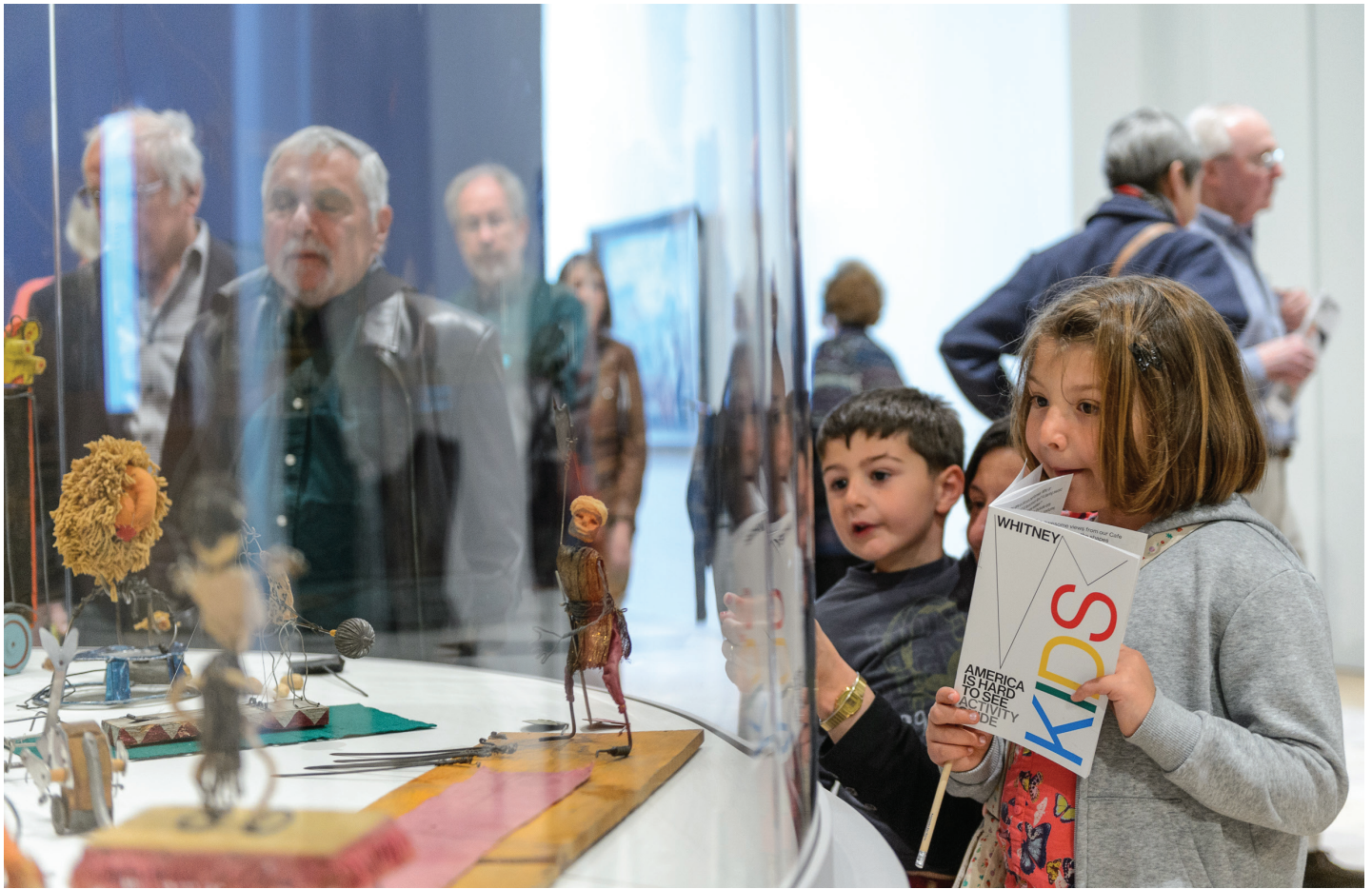
Visitors on opening day of the Whitney, May 2015.

Our guide will tell us the rules at the Museum: