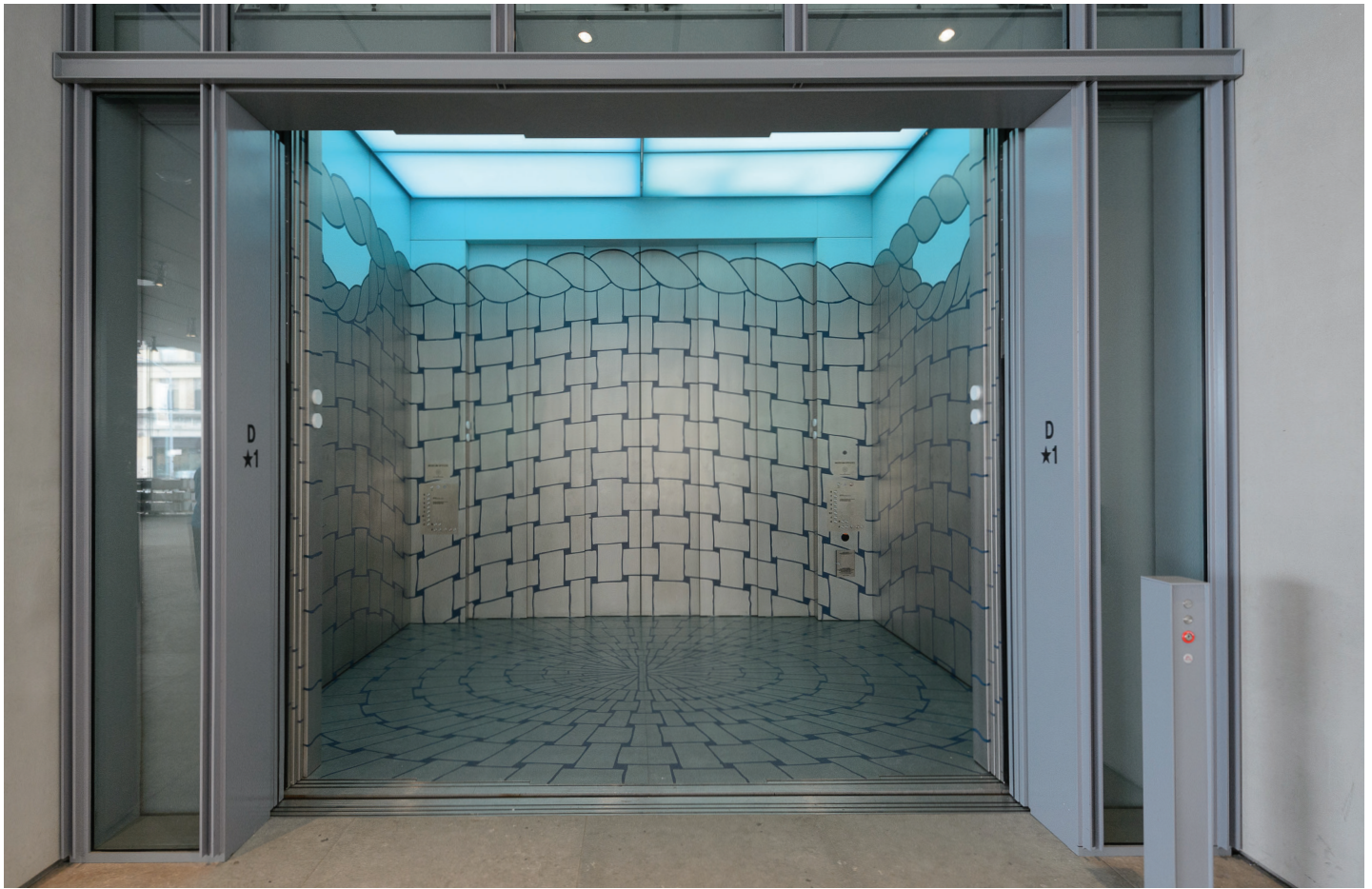
Whitney staff greet families in the lobby, May 2015.

After we get a ticket then we can take either the stairs or the elevator to go to Floor Three. At the Whitney Museum, each elevator is a work of art and is special inside—it might look like a basket, a door, a window, a mirror, or even a table.