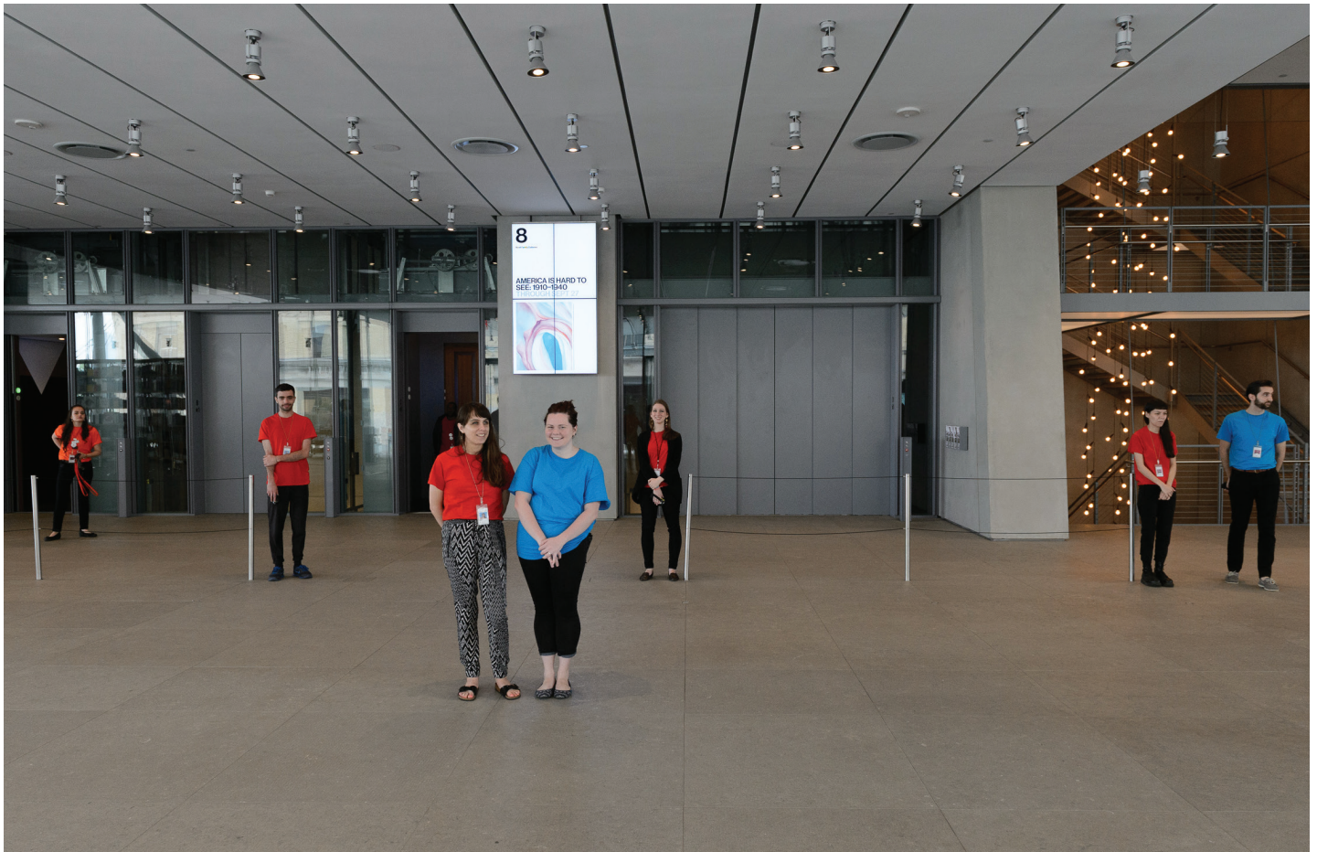
Whitney staff greet visitors in the lobby, May 2015.

When we get to the Museum, we will go into the lobby. In the lobby, we will meet people who work at the Museum. These people are very nice and are here to help make sure we stay safe and have fun.