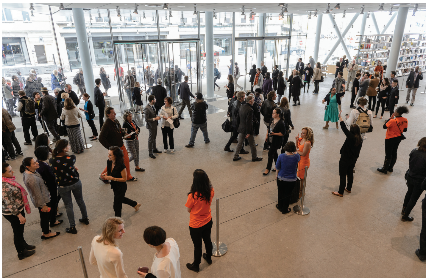
View of the Whitney lobby, May 2015.

When we are finished, we will leave the art-making room and go back down to the lobby. There will be more people in the Museum than when we arrived. This is okay.