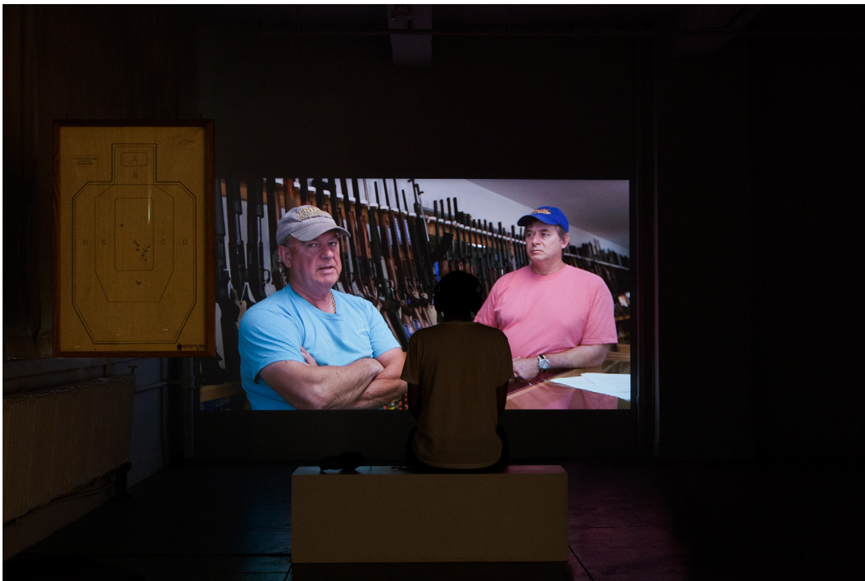
Omar Mismar, Schmitt, You and Me , 2016–2017 54' HD video loop, shooting target