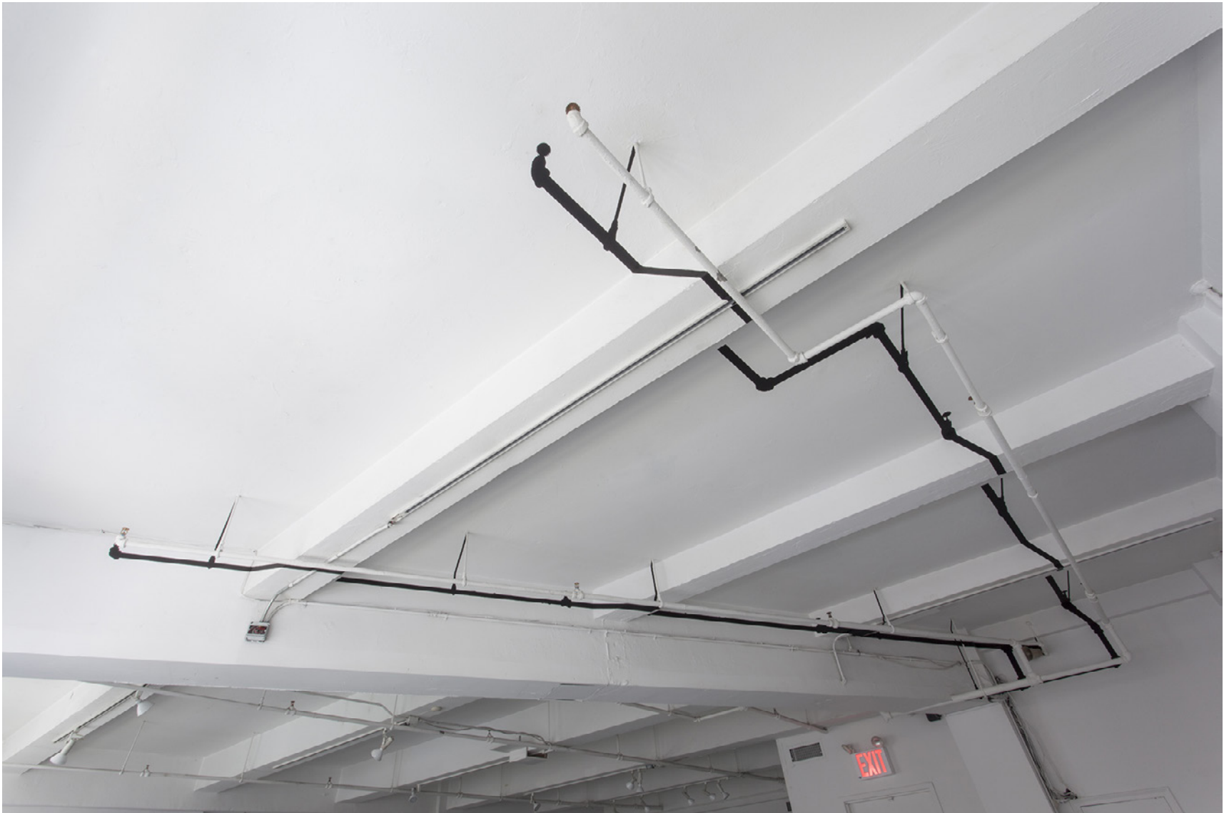
Rebecca Naegele, Sync , 2017 Paint on ceiling