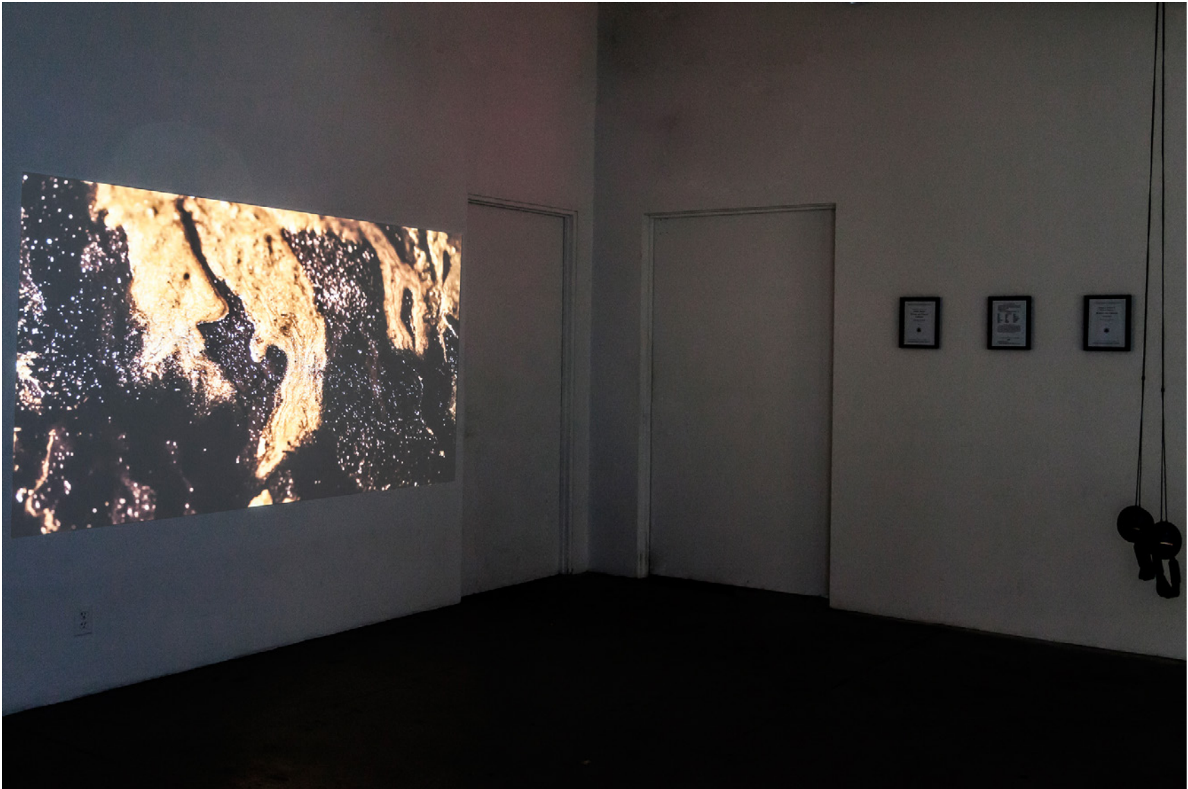
Elena Lavellés, Pattern of Dissolution , 2017 30' HD video loop, archival material