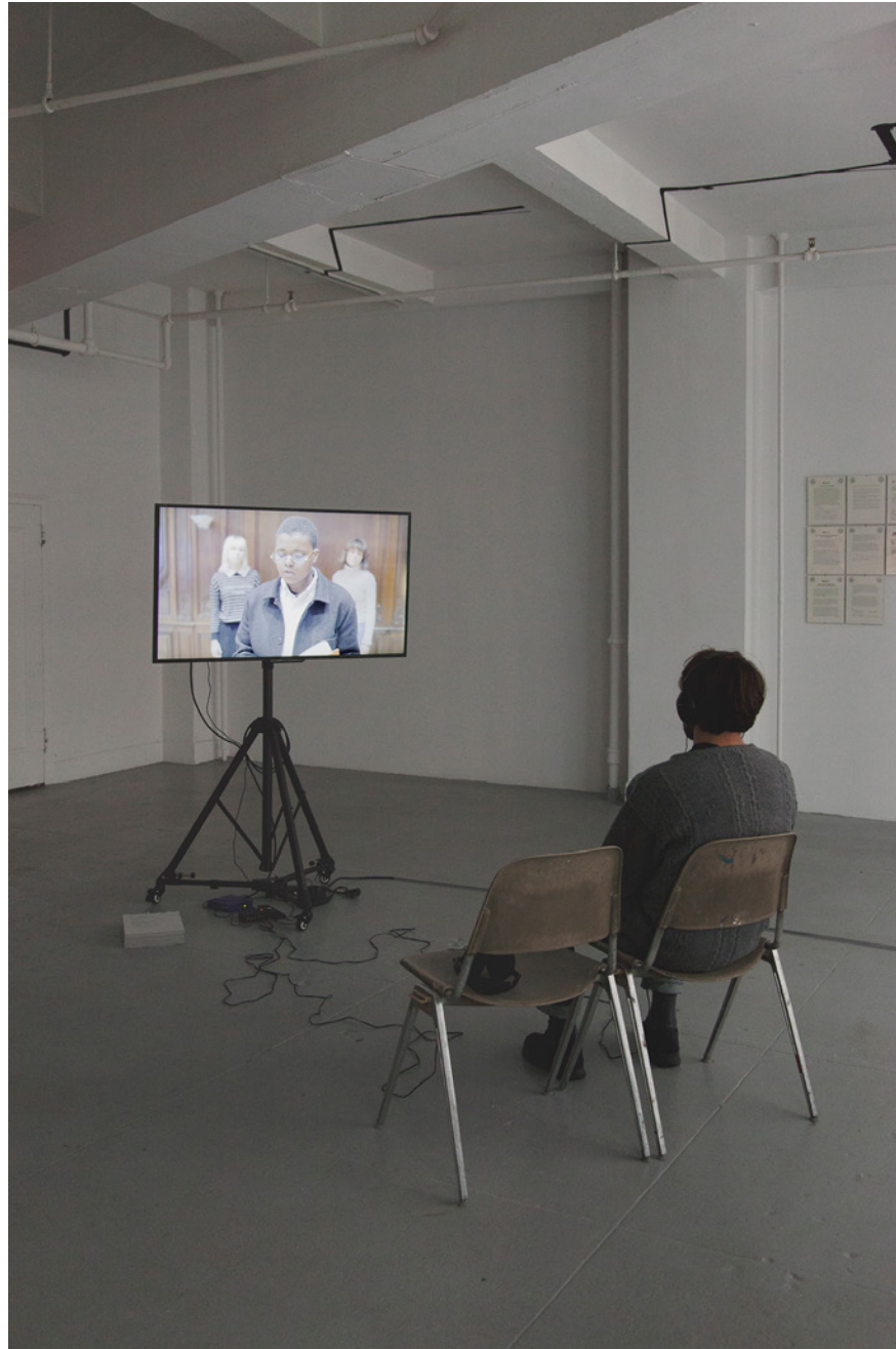
titre provisoire, Some things in common perhaps , 2017 18' HD video loop