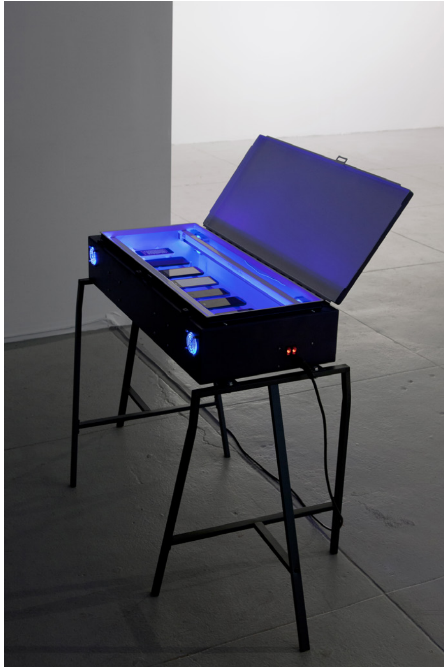
American Artist, The Black Critique (Towards the Wild Beyond) , 2017 Germicidal UV light locker, smart phones