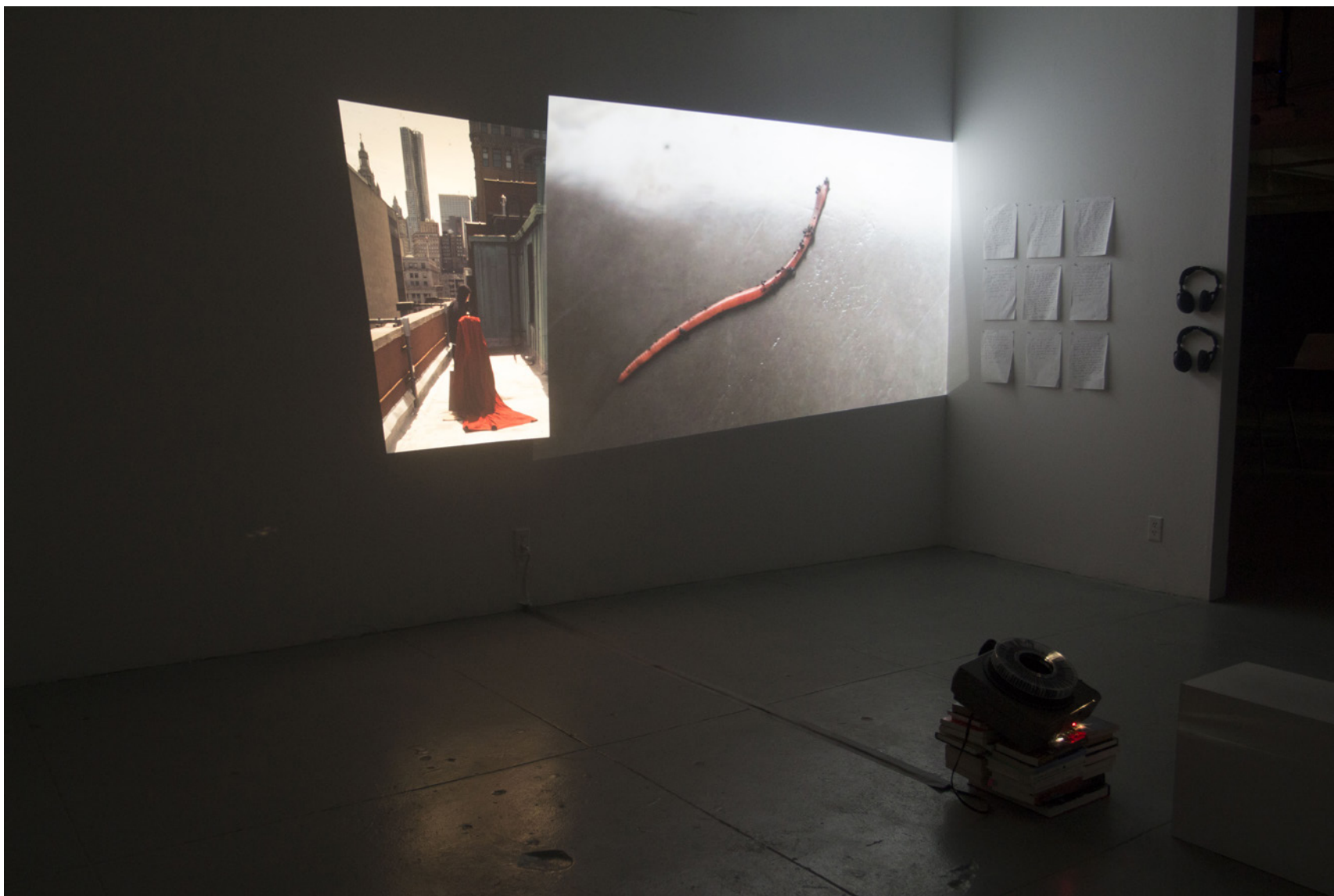
Nathaniel Whitfield, Untitled (cartography of the subconscious) , 2017 Slide projector, video, ink on paper