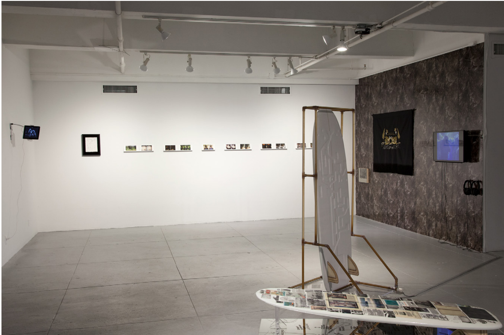
Whitney ISP 2016-2017 Studio Exhibition Installation view (Elizabeth Foundation for the Arts, NY)