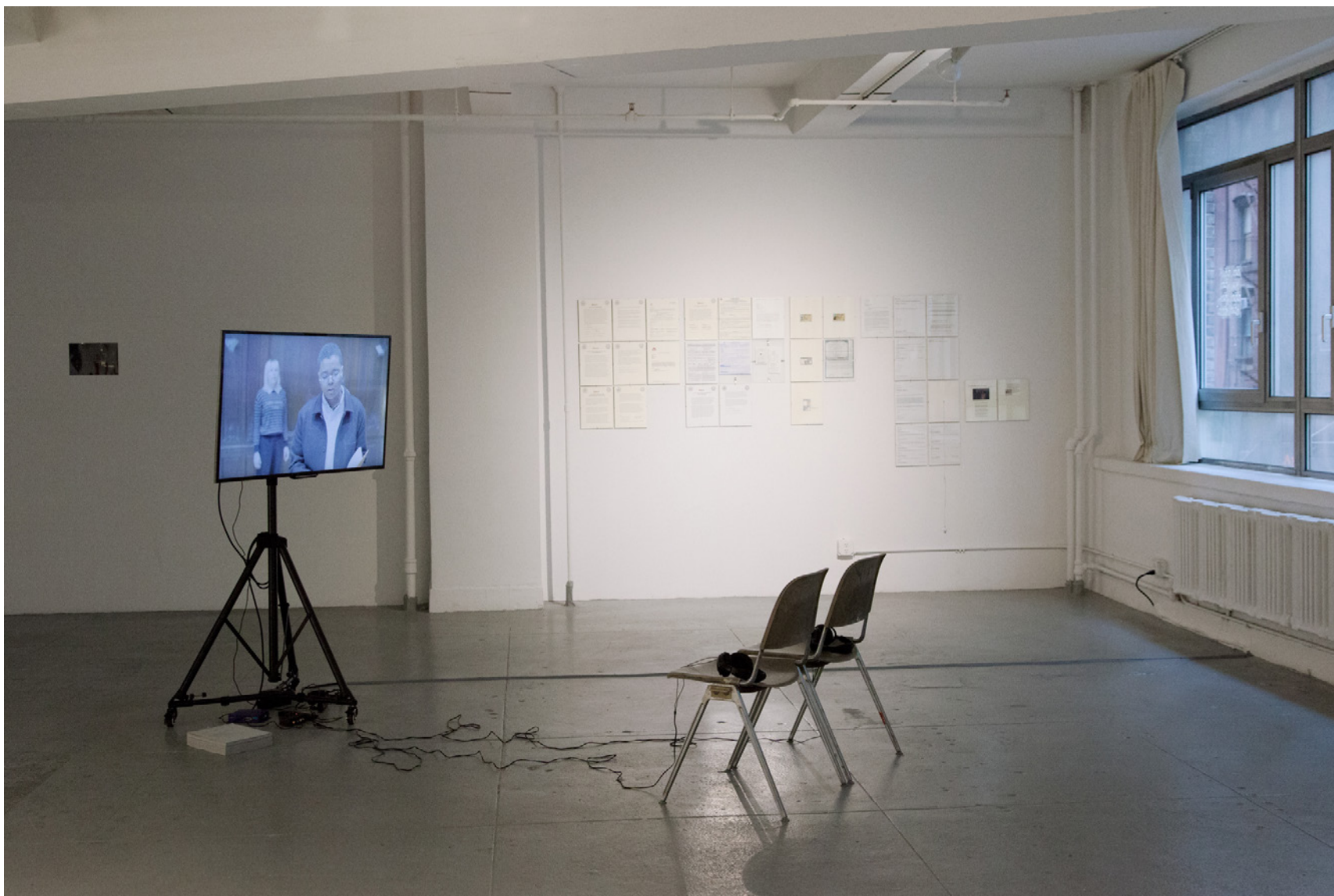
Whitney ISP 2016-2017 Studio Exhibition Installation view (Elizabeth Foundation for the Arts, NY)