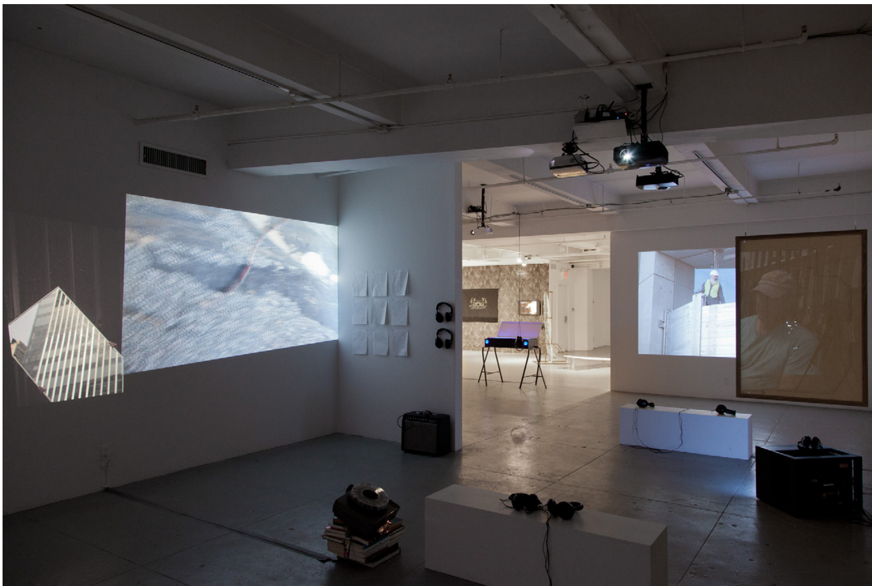
Whitney ISP 2016-2017 Studio Exhibition Installation view (Elizabeth Foundation for the Arts, NY)