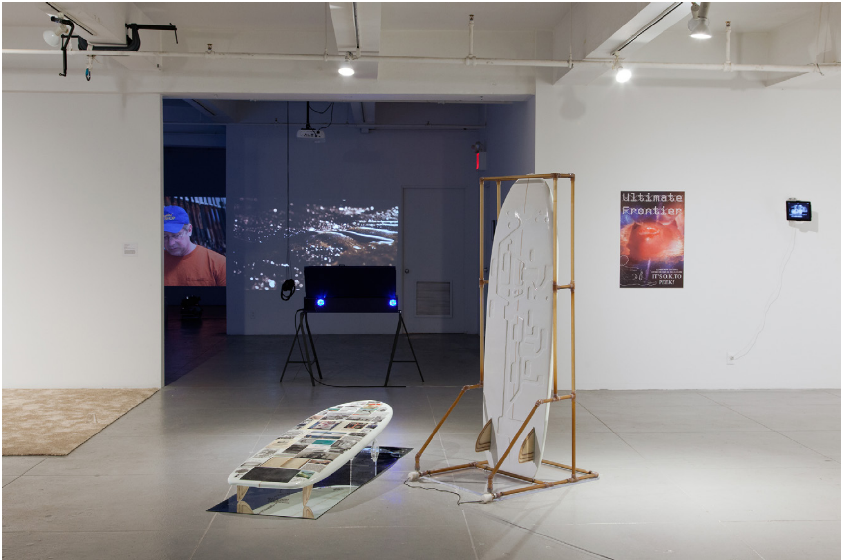
Whitney ISP 2016-2017 Studio Exhibition Installation view (Elizabeth Foundation for the Arts, NY)