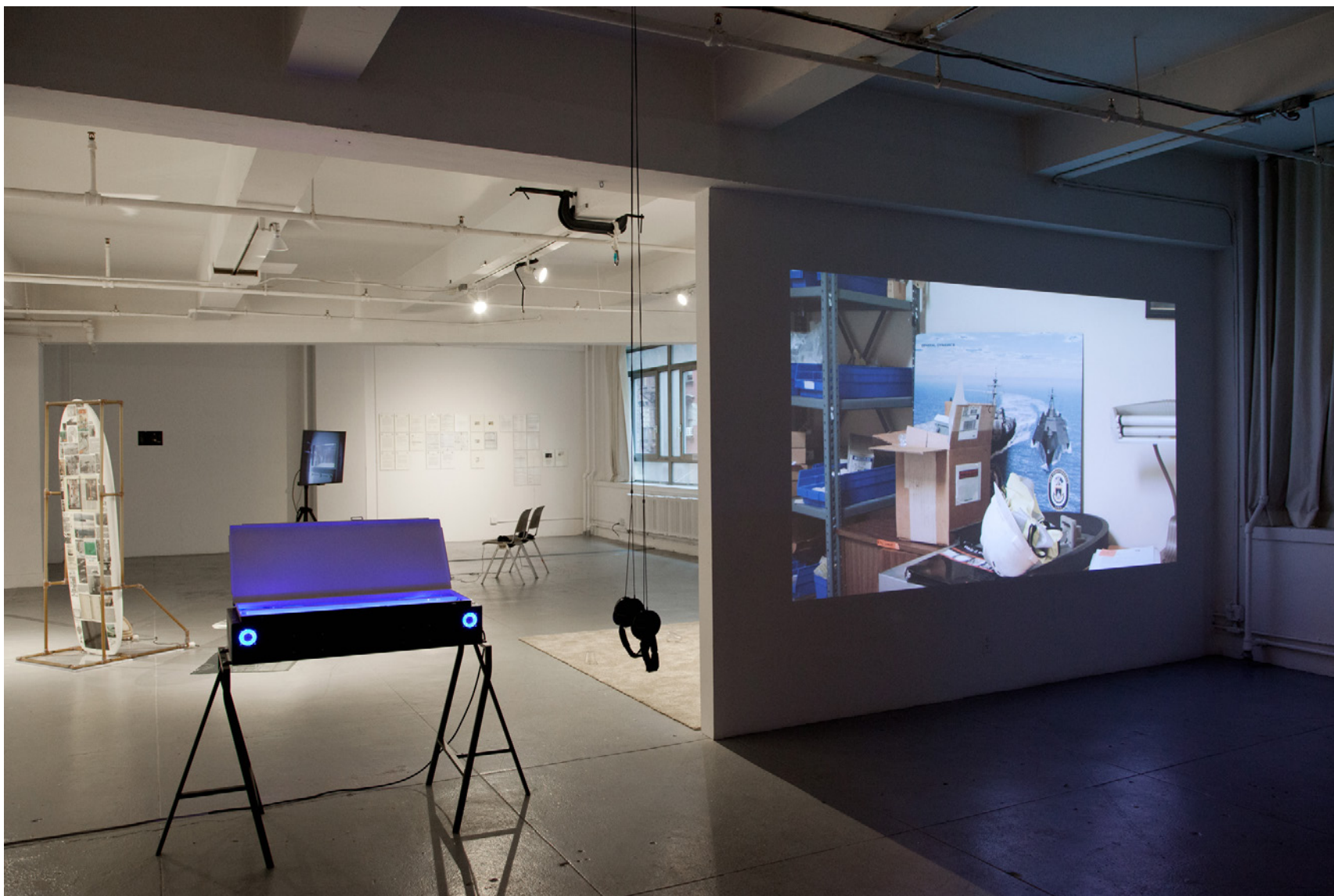
Whitney ISP 2016-2017 Studio Exhibition Installation view (Elizabeth Foundation for the Arts, NY)