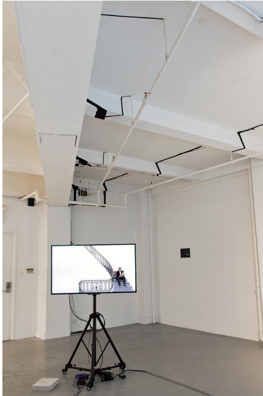
Whitney ISP 2016-2017 Studio Exhibition Installation view (Elizabeth Foundation for the Arts, NY)