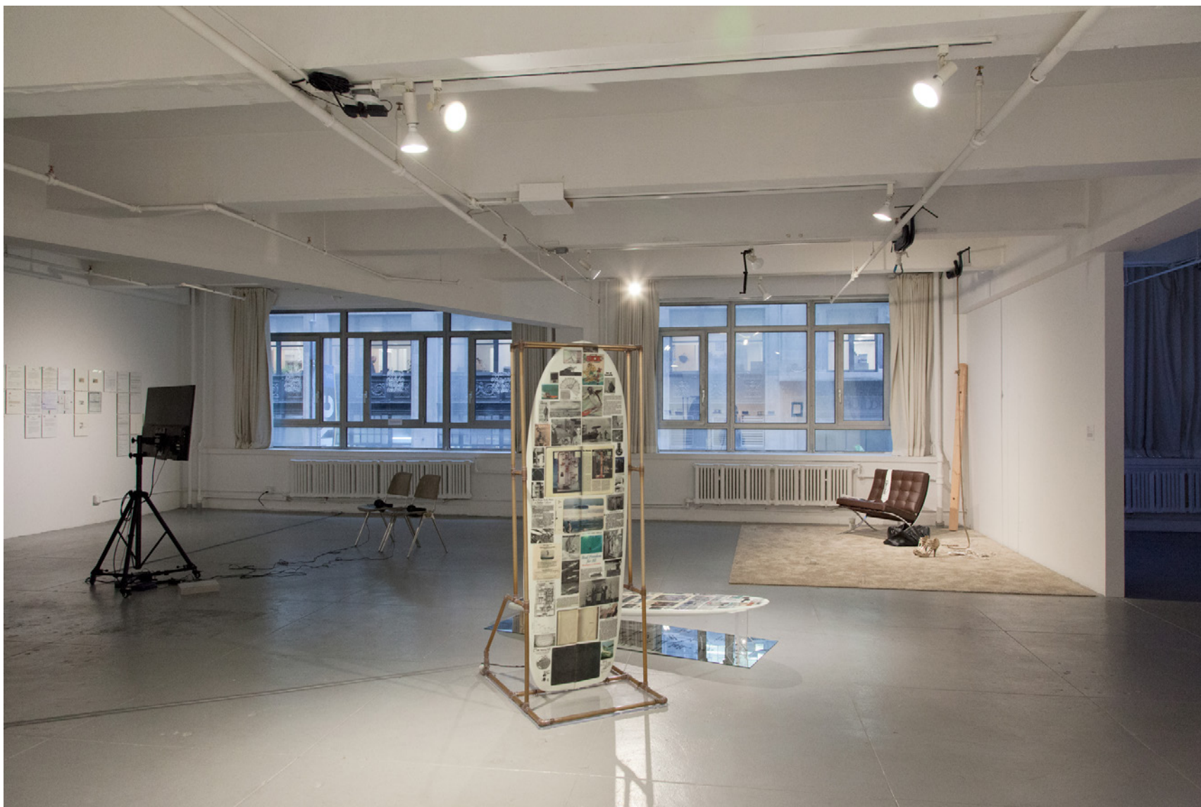
Whitney ISP 2016-2017 Studio Exhibition Installation view (Elizabeth Foundation for the Arts, NY)