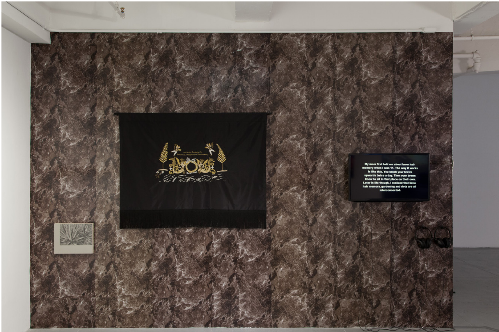
Eleana Antonaki, Uncanny Gardening , 2017

Wallpaper, graphite, resin and gesso on wood panel, single-channel video, gold thread on silk