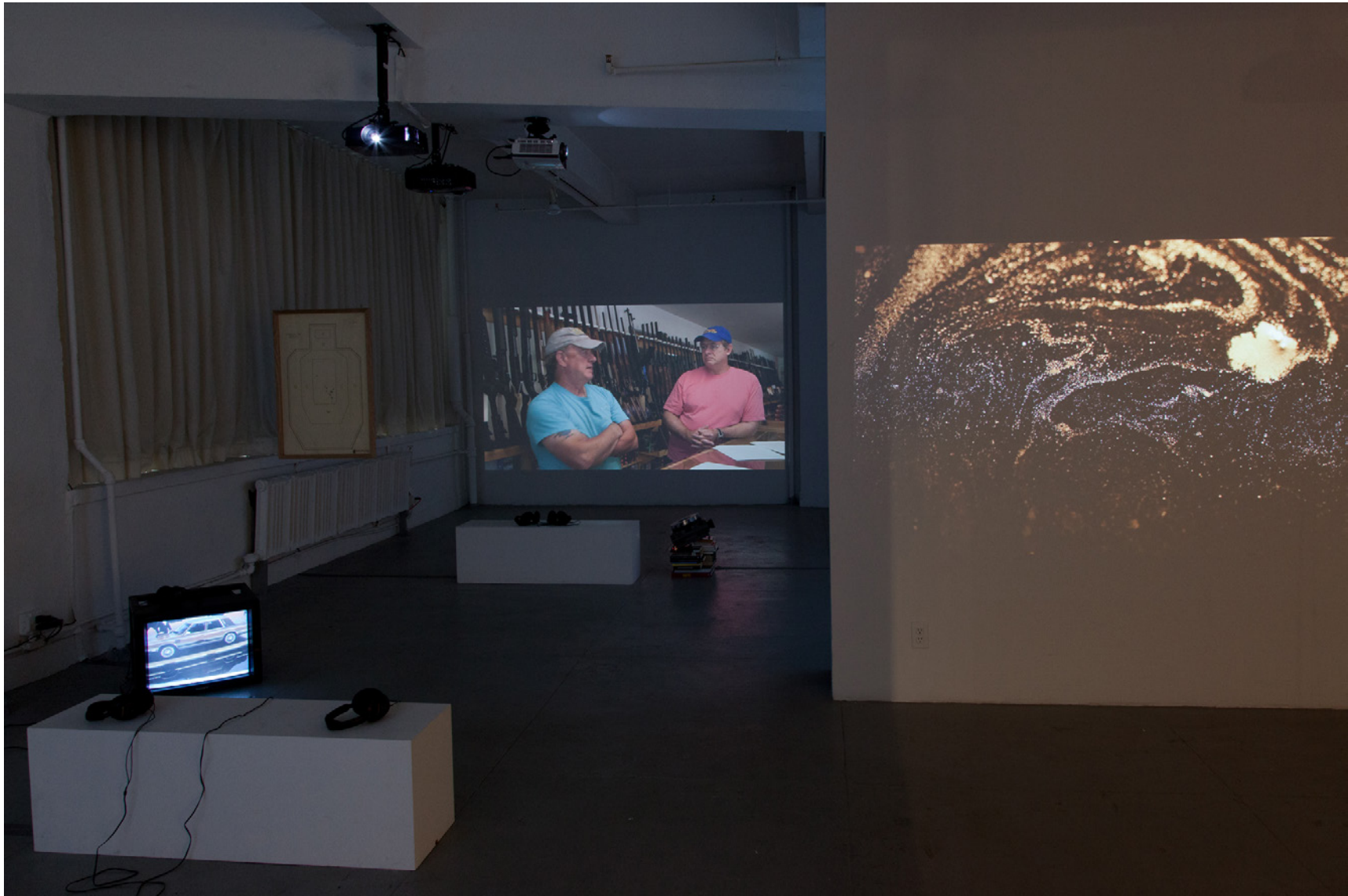
Whitney ISP 2016-2017 Studio Exhibition Installation view (Elizabeth Foundation for the Arts, NY)