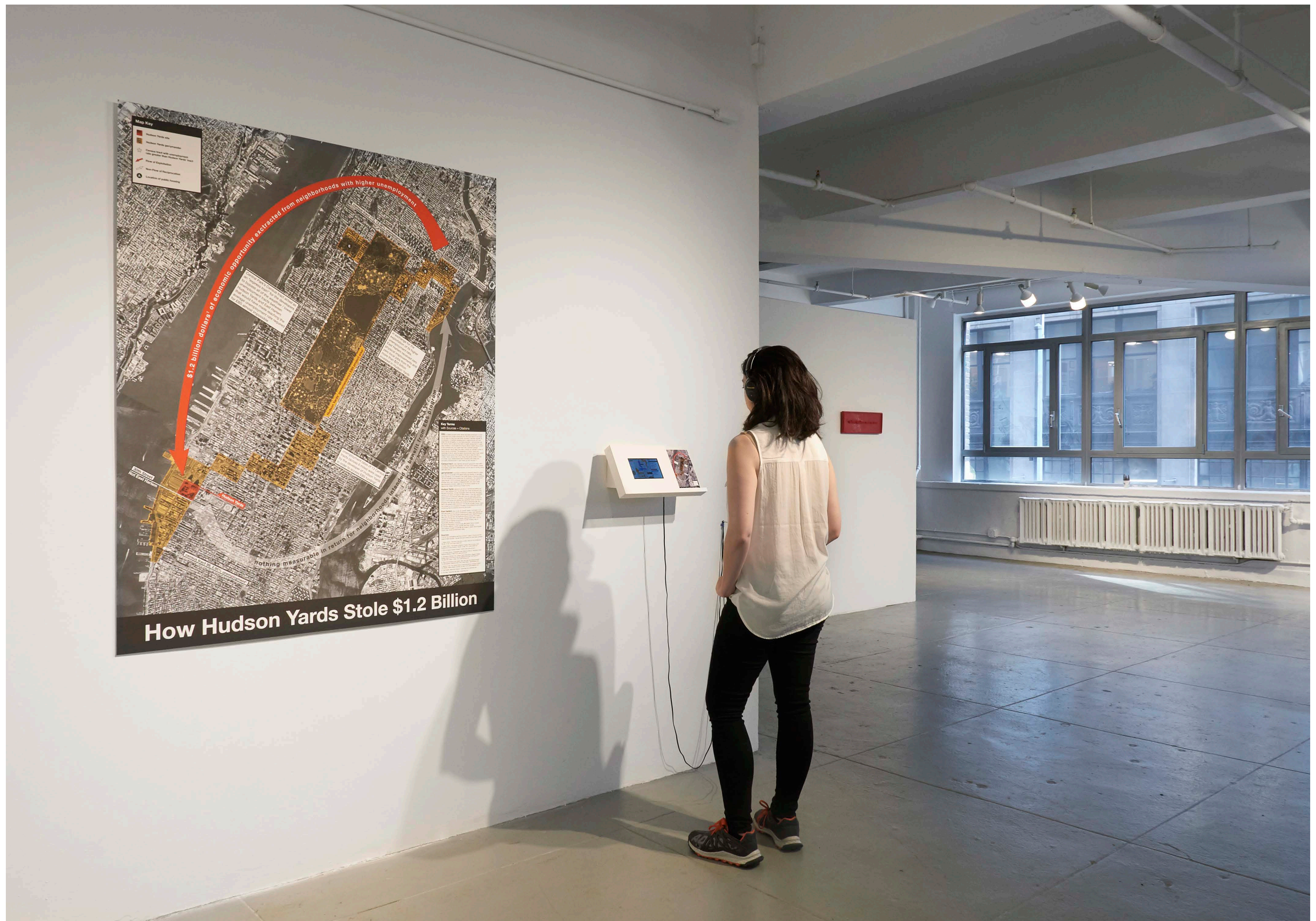
Andrew Sturm Not East Harlem: Mapping Economic Opportunity Theft 2019 - (work in progress)