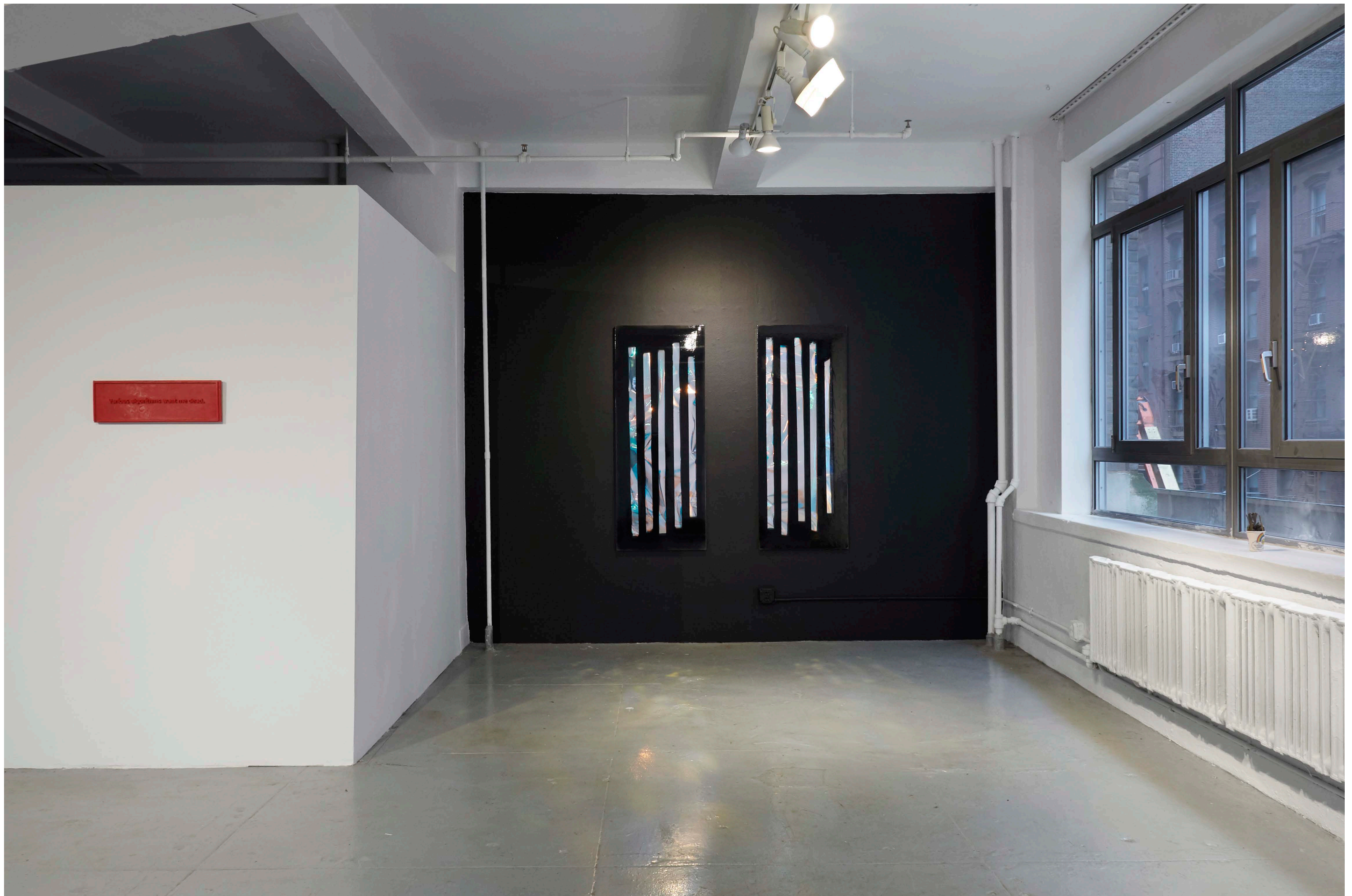
Coleman Collins red wax positive, lost 2019