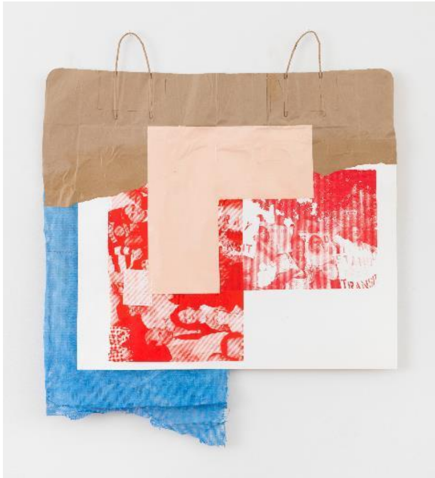
Tomashi Jackson (1980-), Sideways / Side Eye (Peach Shape) , 2018. Silkscreen, oil, and acrylic, on gauze, canvas, and paper, 39 x 32 in. (99.1 x 81.3 cm). Schwartz Art Collection, Harvard Business School, Cambridge, MA.

Tomashi Jackson's densely layered abstractions feature found materials—paper bags, food wrappers, vinyl insulation strips, and storefront awnings—many of them with specific autobiographical references. Jackson's wide-ranging sources also intersect with art-historical, legal, and social histories, and she often uses color materially to encourage meditation on painful subjects. Her three paintings on view here focus on housing displacement in New York by exploring parallels between the history of Seneca Village—which was founded in Manhattan in 1825 by free Black laborers and razed in 1857 to make way for Central Park—and the city's current government program designed to seize paid-for properties in rapidly gentrifying communities across New York, regardless of mortgage status. Targeting elderly Black and Brown property owners, the program transfers ownership to developers. Interweaving these narratives visually and challenging the ways in which we see the information she includes, Jackson creates dynamic passages of clashing complementary hues. She also lights her surfaces so they resemble stained glass, refracting image and color cinematically onto surrounding spaces.