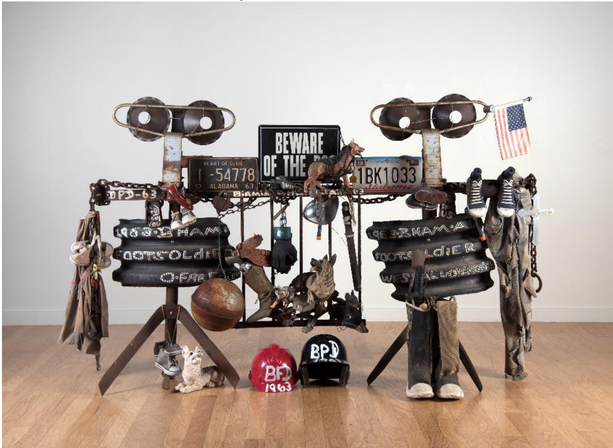
Joe Minter (1943-), '63 Foot Soldiers , 1999. License plates, shoes, found toys, chains, metal grate, paint, plastic, and clothes, 59 × 81 × 31 in. (149.9 × 205.7 × 78.7 cm). Collection of the Birmingham Museum of Art; Museum purchase with funds provided by Mr. and Mrs. James Outland © 2019 Joe Minter / Artists Rights Society (ARS), New York

Joe Minter uses found materials to create allegorical mixed-media critiques of the history of race and class inequities in the United States. Drawing on his training in construction and welding, Minter repurposes the detritus of rural life to make dense, geometrically complex, often anthropomorphic totems that mine the rich tradition of Southern yard art. Abstract assemblages of rusted chains, agricultural tools, household furniture, garments, license plates, and wood fragments on which he occasionally paints texts.