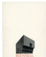
Whitney Biennial 1991 Jan 1–Jun 16, 1991