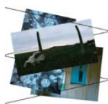
Whitney Biennial 2017 Mar 17–Jun 11, 2017