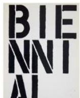
Whitney Biennial 1989 Apr 13–Jul 16, 1989