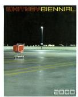
Whitney Biennial 2000 Mar 23–Jun 4, 2000