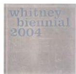
Whitney Biennial 2004 Mar 11–May 30, 2004