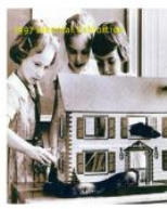
Whitney Biennial 1997 Mar 20–Jun 1, 1997