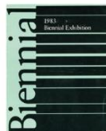
Whitney Biennial 1983 Mar 15–May 29, 1983

A screenshot of the new online resource exploring the history of the Whitney Biennial.