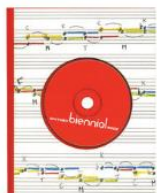
Whitney Biennial 2002 Mar 7–May 26, 2002