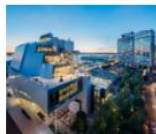
Whitney Biennial 2019 May 17–Sep 22, 2019