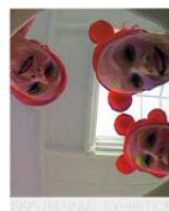
Whitney Biennial 1995 Mar 23–Jun 4, 1995