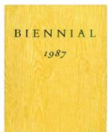
Whitney Biennial 1987 Apr 10–Jul 5, 1987