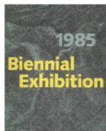
Whitney Biennial 1985 Mar 13–Jun 9, 1985