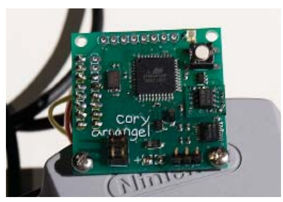
Various Self Playing Bowling Games (aka Beat the Champ), 2011 (detail). Hacked video game controllers, game consoles, cartridges, disks, and video, dimensions variable. Collection of the artist; Team Gallery, New York; Lisson Gallery, London; and Galerie Thaddaeus Ropac, Salzburg and Paris

The idea of a technological tool as an integral part of an artwork is also evident in the series of Hello World sculptures, 3-d shapes that are also randomly generated by a computer program Arcangel wrote and then sent to a factory, which produces them by means of a robotic 3-d wireform machine that can bend metal in any direction. The CNC Wireforms—CNC standing for Computerized Numerical Control—"demonstrate" automated tools that are operated by computer-programmed commands. The wireforms produced by CNC machines are commonly used in furniture or point-of-purchase (POP) display stands that incorporate advertising next to the merchandise and encourage impulse buying. Arcangel's Hello World wireforms are the epitome of a fusion between abstract art, product demonstration, and marketing display: these abstract sculptures, which reference canonic works of modern art,