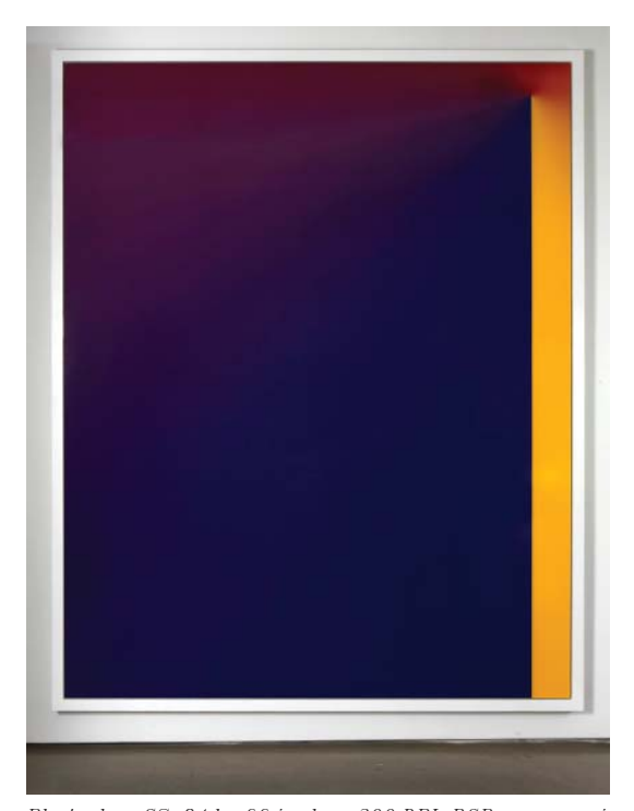
Photoshop CS: 84 by 66 inches, 300 DPI, RGB, square pixels, default gradient "Blue, Red, Yellow," mousedown y\!=\!18200 x\!=\!1350 , mouseup y\!=\!23400 x\!=\!18250 , 2010, from the series Photoshop Gradient Demonstrations, 2008– . Chromogenic print, 84 x 66 in. (213.4 x 167.6 cm). Unique. Private collection; courtesy Team Gallery, New York, and the artist