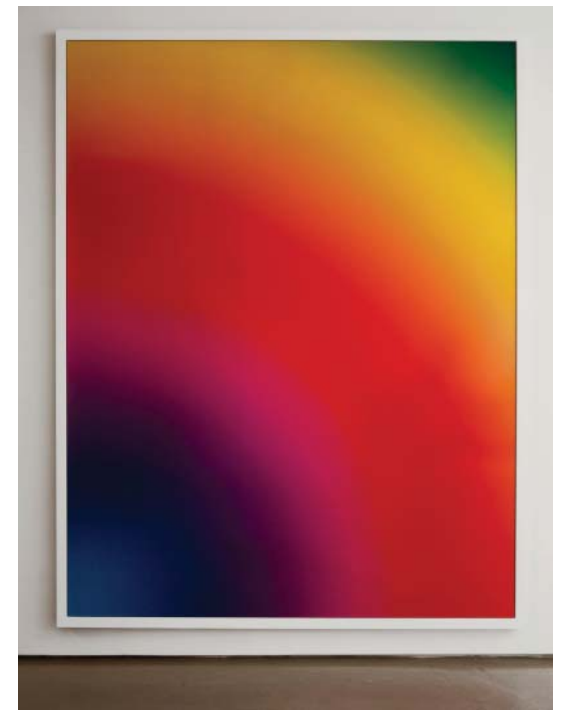
Photoshop CS: 84 by 66 inches, 300 DPI, RGB, square pixels, default gradient "Spectrum," mousedown y=25100 \ x=0 , mouseup y=0 \ x=19750 , 2010, from the series Photoshop Gradient Demonstrations, 2008-. Chromogenic print, 84 x 66 in. (213.4 x 167.6 cm). Unique. Private collection; courtesy Team Gallery, New York, and the artist

The instruction-based practices of Dada and conceptual art of the 1960s and 1970s are important art-historical precedents of contemporary media and software art in which a process—such as a computer program, machine, or other procedural invention—is set in motion to create a work of art. Arcangel's moving "structure" also references the 1950s and 1960s as the golden age of kinetic¹ sculpture, which was pioneered by artists such as Alexander Calder, Jean Tinguely, and the Zero Group and built upon earlier experiments by artists including Marcel Duchamp (Bicycle Wheel, 1913) and László Moholy-Nagy (Light-Space-Modulator, 1930).