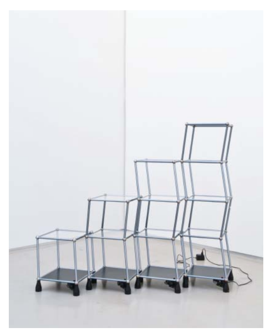
Research in Motion (Kinetic Sculpture #4), 2011. Modified silver dancing stands and custom electronics, dimensions variable. Private collection; courtesy the artist and Galerie Thaddaeus Ropac, Salzburg and Paris

Art-historical references are also an important part of Arcangel's series of pen plotter drawings, Hello World (2011) and Palms (2011), simple line drawings produced by means of out-of-date pen and pencil plotter machines from the 1980s and 1990s. As technological products, pen plotters preceded inkjet printers—the current dominant printing technology in contemporary art—and use an actual pen (a miniature "robotic arm") that presses against the paper. Artists started creating computer-generated, "algorithmic" drawings as early as the 1960s, and some were included in the exhibition Computer-Generated Pictures (1965) at the Howard Wise Gallery in New York, which featured works by Bela Julesz and A. Michael Noll. Frieder Nake, Vera Molnar, Charles Csuri, Manfred Mohr, Harold Cohen, and Roman Verostko were among the other early practitioners of the medium. Arcangel is well aware that these early experiments, along with much of kinetic art of the 1950s and 1960s, were largely written out of mainstream art history and through these works creates a link between the cycle of obsolescence in technology and of omission in art history.