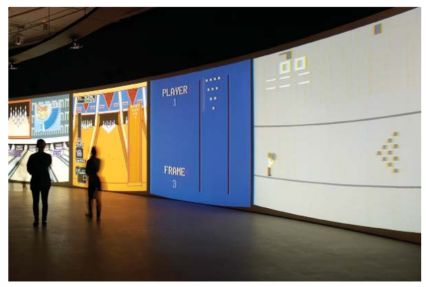
Various Self Playing Bowling Games (aka Beat the Champ), 2011 (installation view of Cory Arcangel: Beat the Champ Barbican Art Gallery, London, February 10-May 22, 2011). Hacked video game controllers, game consoles, cartridges, disks, and video, dimensions variable. Co-commissioned by the Whitney Museum of American Art, New York, and Barbican Art Gallery, London. Collection of the artist; Team Gallery, New York; Lisson Gallery, London; and Galerie Thaddaeus Ropac, Salzburg and Paris.

As in many of his video game projects, Arcangel modifies and undermines the experience of play. Viewers do not get to interact with the bowling games but instead watch the games seemingly play themselves. Over a period of a couple years, Arcangel worked with a programmer and engineer to produce what they call a "video game TIVO," a microcontroller capable of recording and playing back button pressing. Affixed to the respective controller for each video game,