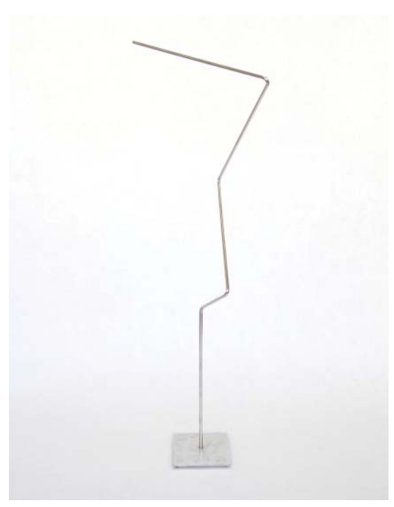
<code>Hello World #1, 2011.</code> CNC bent stainless steel with electropolish finish (produced with artist's software), 32 \times 7 \ 1/2 \times 5 in. (81.3 x 19.1 x 12.7 cm). Collection of the artist and Team Gallery, New York

as "professional tools," a humorous twist on Arcangel's mixing and matching of professional and amateur technologies.