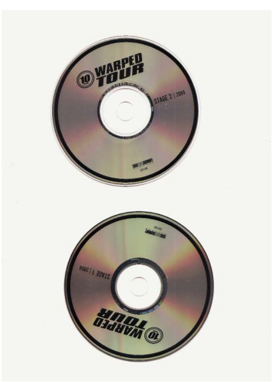
Since U Been Gone, 2011 (production detail). Fourteen screenprints and metallic foil, 11 11/16 x 8 1/2 in. (29.7 x 21.6 cm). Collection of the artist; Team Gallery, New York; Lisson Gallery, London; Galerie Thaddaeus Ropac, Salzburg and Paris

The reflection on technological delivery formats and storage is also present in Since U Been Gone (2011), a series of prints created by scanning music CDs and then using a combination of metallic stamping foils and silkscreening to produce a trompe l'oeil effect. The music stored on the original CDs is related to and traces the musical genealogy of the Kelly Clarkson song "Since U Been Gone" (2004) through parallel musical and cultural influences. One of the elements traced, for example, is the buzzsaw guitar technique. This technique, according to popular legend, was invented by Dee Dee Ramone in the 1970s, updated by the Bangles in the 1980s, and reappeared in the music of the Strokes in the late 1990s; this sound and phrasing